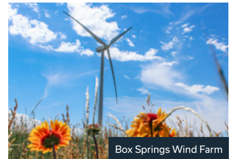
Box Springs Wind Farm