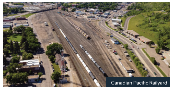
Canadian Pacific Railyard

Medicine Hat is served by Canadian Pacific Railway (CP Rail). CP Rail's mainline splits at Medicine Hat, running south to Lethbridge and north to Calgary.