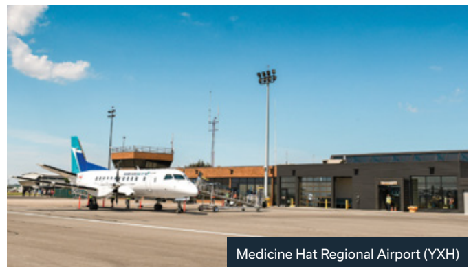
Medicine Hat Regional Airport (YXH)

Canada's largest beyond visual line of sight restricted airspace is located in Foremost, Alberta. The 2,400 square kilometres of controlled airspace is open to companies to test new technology.