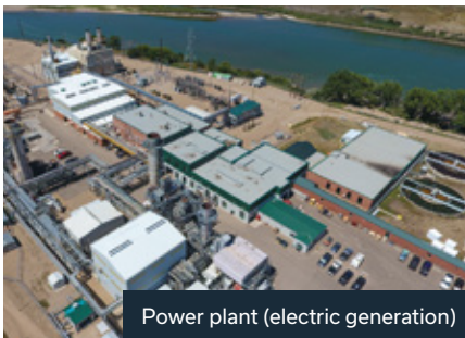
Power plant (electric generation)