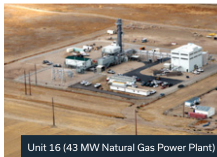
Unit 16 (43 MW Natural Gas Power Plant)