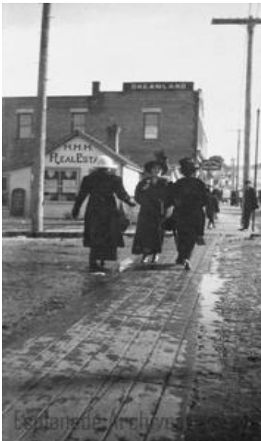
6 Avenue & 3 rd Street, Southeast corner c. 1912