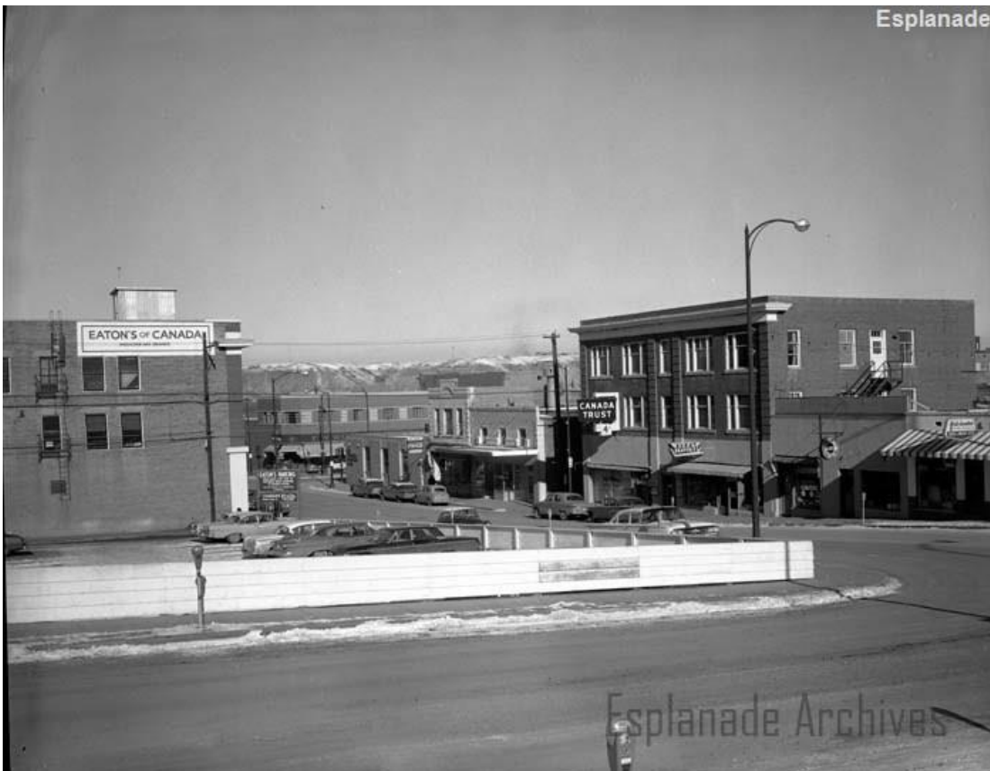
Sixth Street SE, circa 1962.