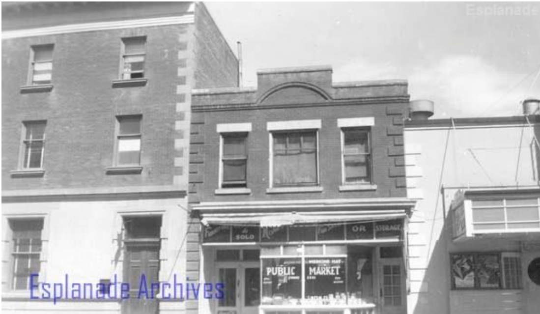
Block built by William Cousins, 1911.