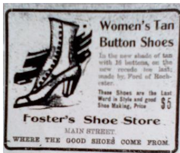
MH News Oct. 21, 1913

Foster Shoe Store to the left, with signage on awning and hanging sign ca 1914 0424.0003*