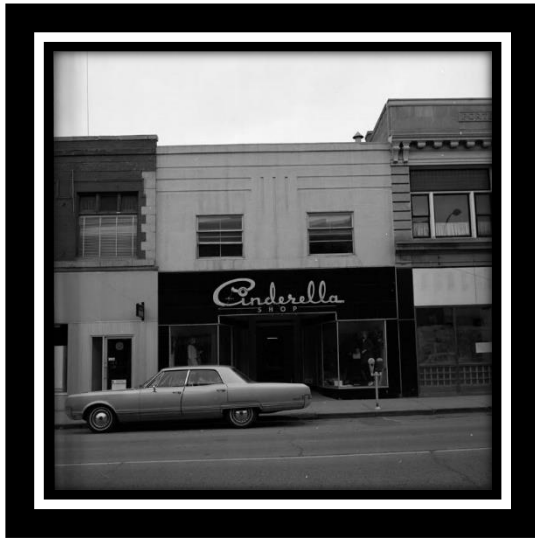
Above: 1970, with stucco covering the original brick front 5194A.18*

“The longest occupant of the building, from 1939 to 1976 was the Cinderella Dress Shop, 37 years.”