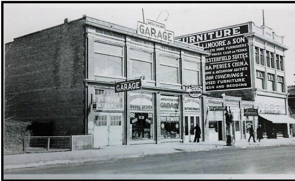
Medicine Hat Garage 1934 #0442.0859 *

Images in photo: L-R MH Garage, James S. Jordan Real Estate, E. Norton Dowson Printer, Tweed Block* with JJ Moore & Son.