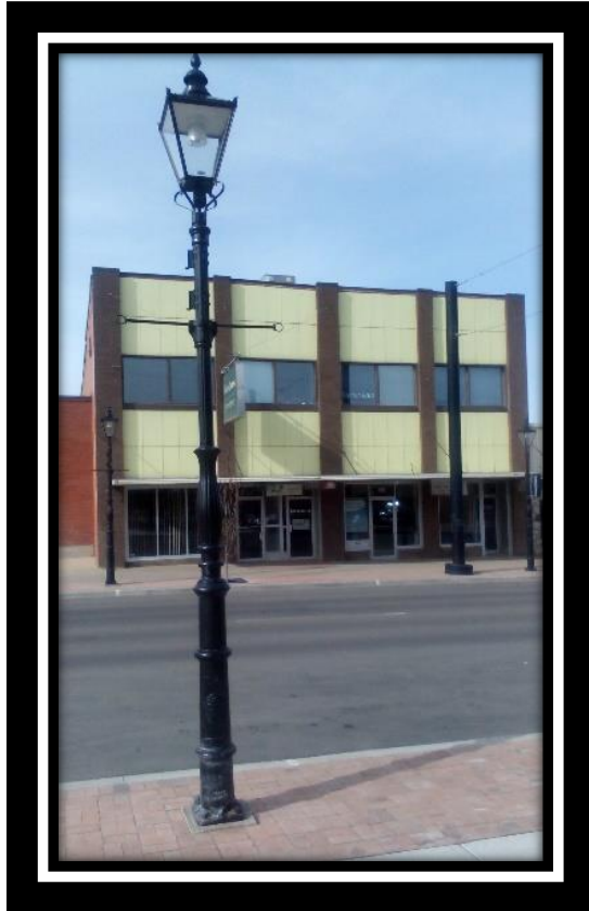
Medicine Hat Garage as the Rellim Building, 2016