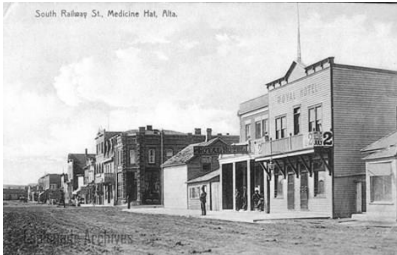
The Royal Hotel in 1908. Original building is frame. The brick addition is to the immediate left. There are decorations promoting the July 2, 1908 Stampede. 0329.0054

It boasted a bar as one of the largest in Alberta. There were 29 additional bedrooms with lavatories located on each floor.