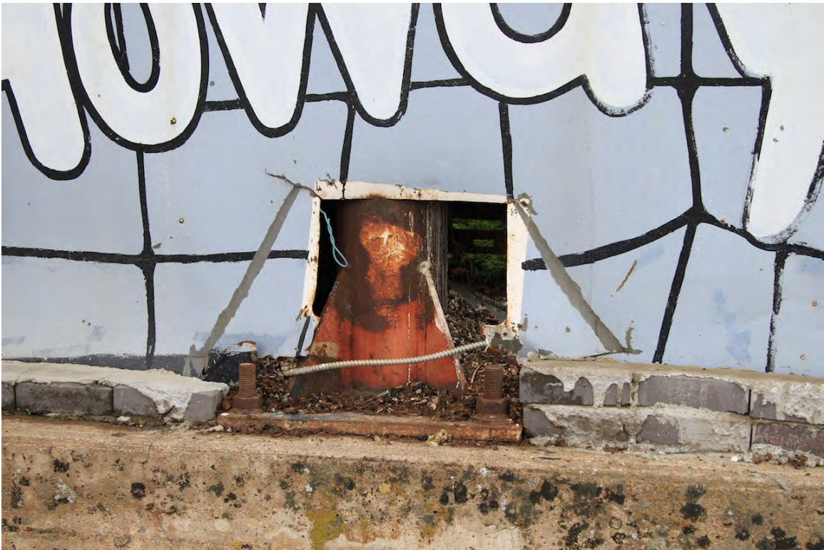
Base of cowboy showing cast iron column, June 2014 (DLA)