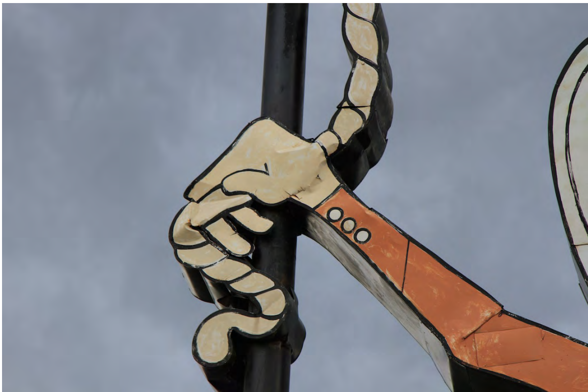
Attachment juncture of cowboy to cast iron column and small access panel on bottom right side of photo, June 2014 (DLA)