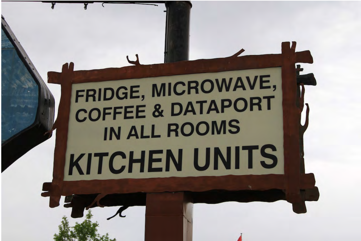
Lower sign (Backlit), June 2014 (DLA)