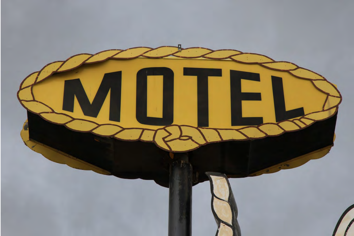
Upper sign that rotates, June 2014 (DLA)