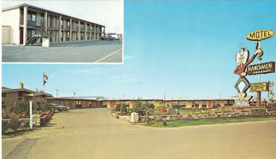
Ranchmen Motel grounds, circa 1960s

On Trans Canada Highway S.W. Tel. (403) 527-2263