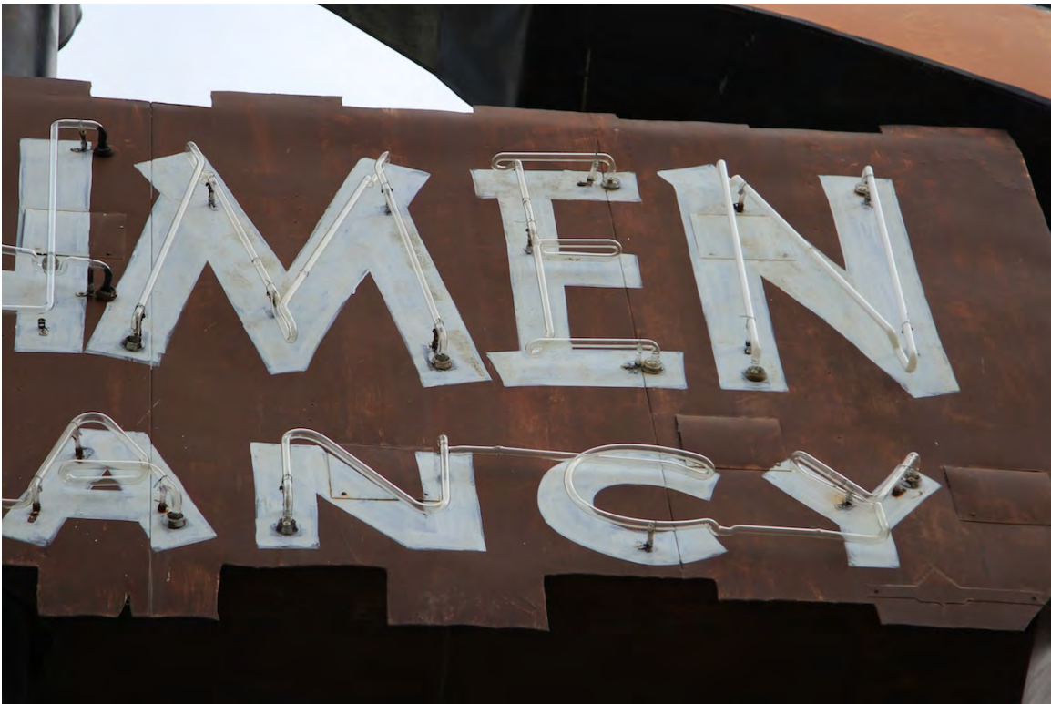
Close up of neon on 'Ranchmen No Vacancy sign; Neon Products logo on bottom right of photo (painted over), June 2014 (DLA)