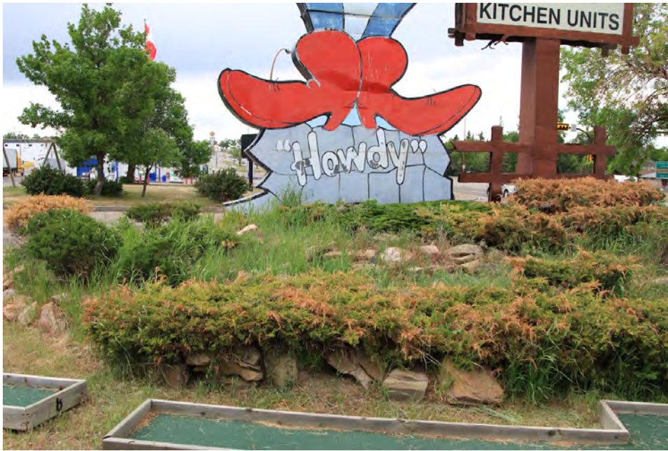
Base of figurine, south side, showing gardens, June 2014 (DLA)