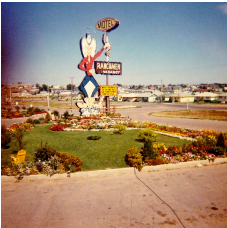
Landscaping surrounding sign, 1965