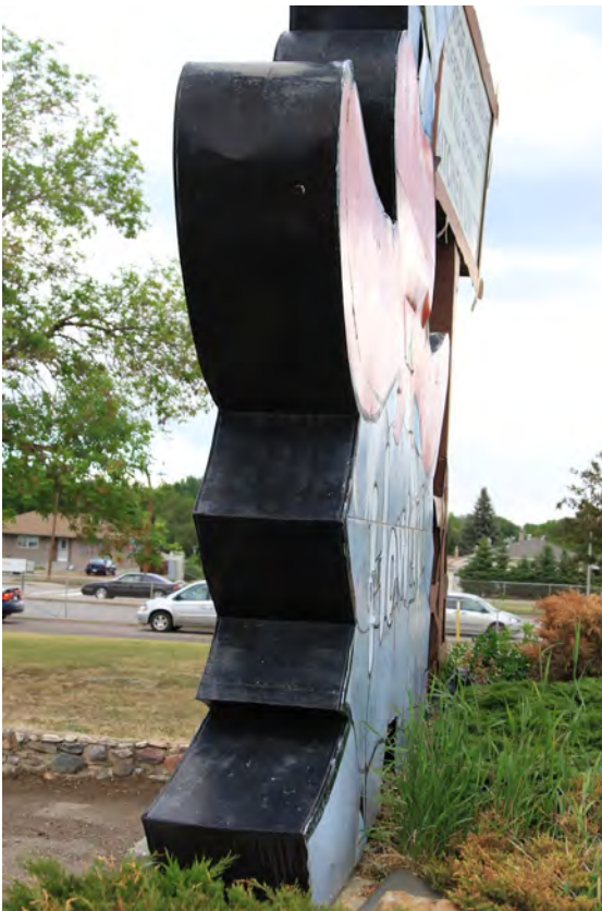
West side of sign showing depth of figurine, 2014 (DLA)