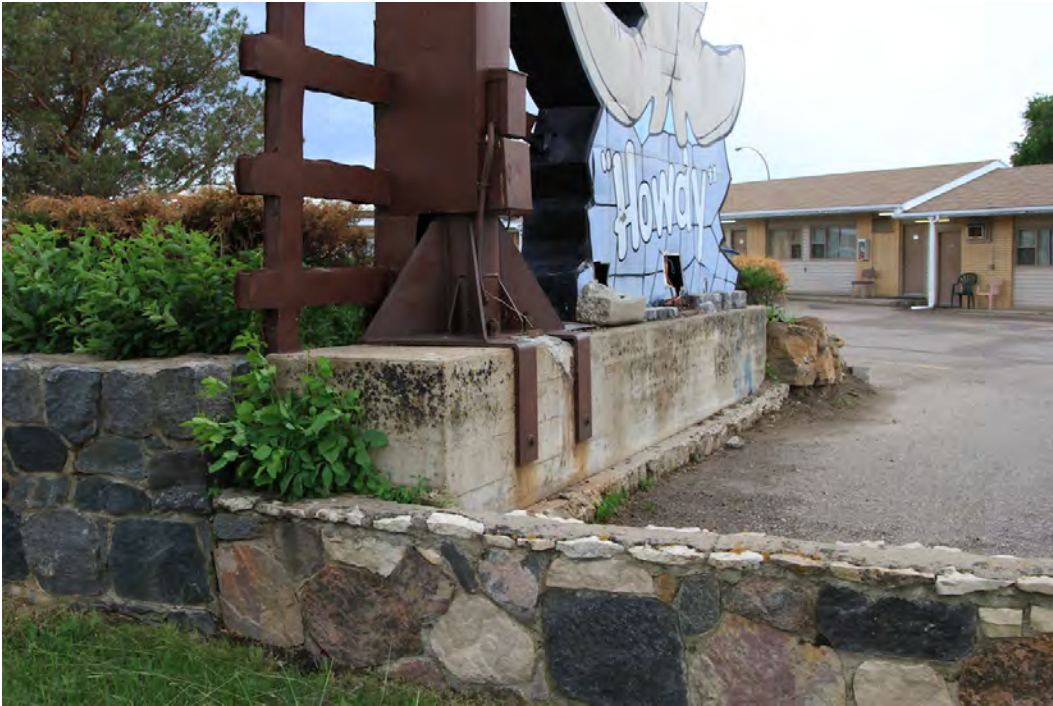
Surrounding rock walls and board formed concrete base, 2014 (DLA)