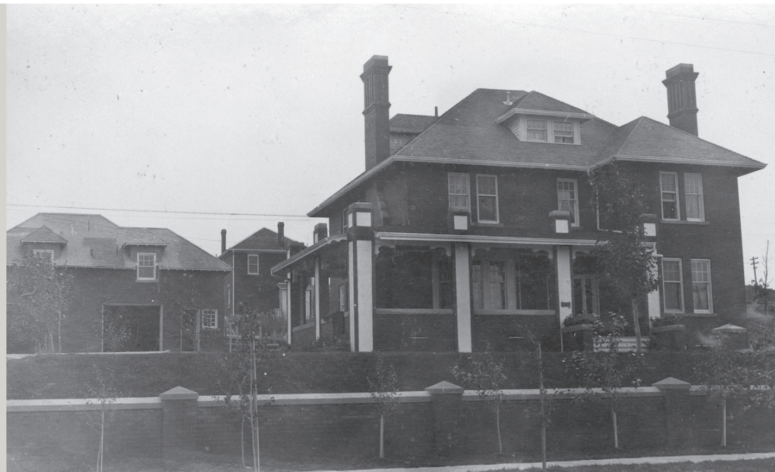
The Brown Thomas Residence (right) and its associated Carriage House (left)

The Brown Thomas Residence and Carriage House are further valued as impressive