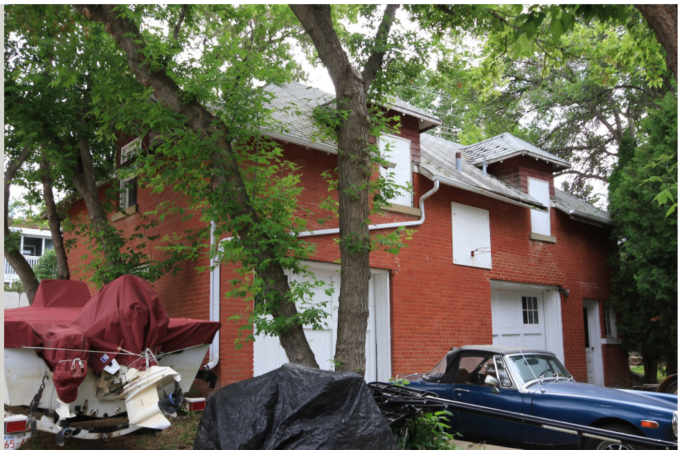
The Brown Thomas Carriage House which was built the following year after the associated residence

The Carriage House is in poor condition with multiple areas of the building's exterior failing. Each of the Carriage House's façades show significant stepped cracks indicating underlying structural issues at play that require immediate attention to limit further damage. Lower courses of brick show signs of moisture saturation through the presence of efflorescence. Significant mortar loss is evident throughout the building's exterior. Past repointing and brick replacement has been completed without consideration of the original fabric of the building. The rear of the carriage house has undergone numerous alterations overtime, likely due to the gradual re-grading of the back lane. The Carriage House's roof is in poor condition, in part due to the overhanging trees, and the shingles are curling and split in areas. Gutters and rainwater leaders have not been maintained resulting in saturation of the exterior brick in areas. The building's original fenestration is intact with many of the original 6-over-1 single-hung wooden-sash windows present. The Carriage House requires immediate action to prevent the ongoing deterioration of this historic resource.