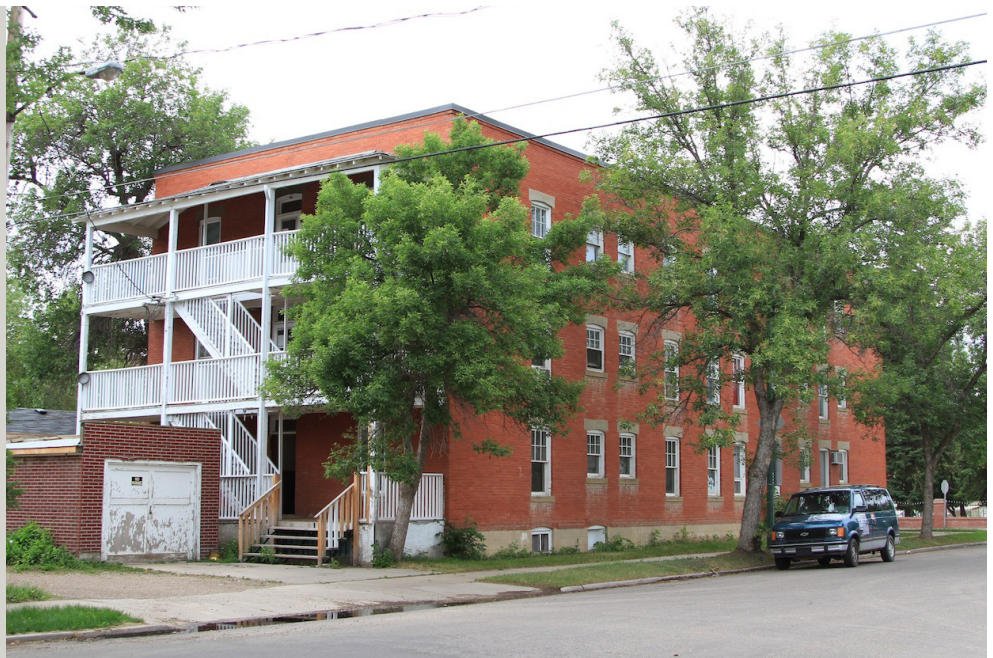
The rear and east facades of the Connaught Apartments