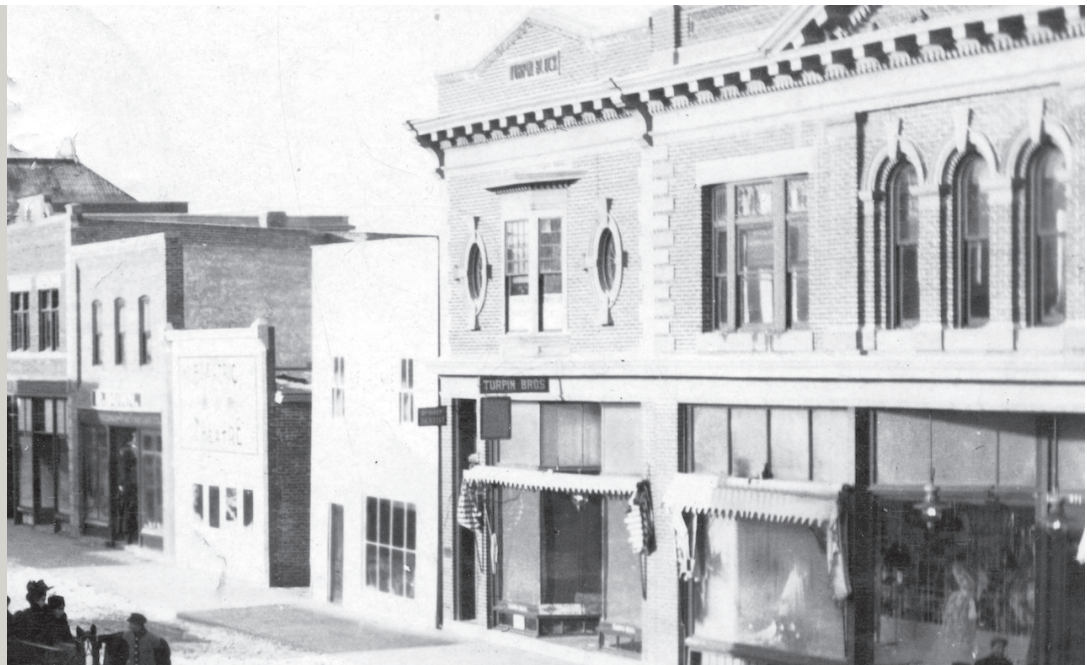
The Turpin Block (centre) in the early 1910s. The adjoining Stewart & Tweed Block, on the right, was destroyed by fire in December 1999

The Turpin Block is valued as a landmark in the downtown core for its high style Edwardian era architecture, its unique detailing, and prominent position on 2nd Street SE.