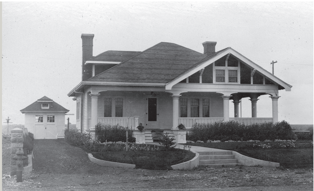
The Brown Durand Residence as it appeared prior to having its verandah enclosed, circa 1913