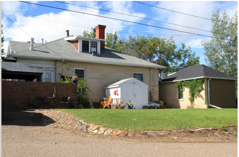
Donald Luxton & Associates June 2013