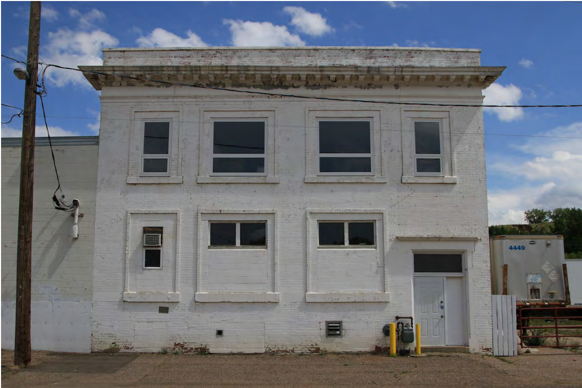
Northwest façade of Tabor Candy Co. Ltd., June 2014