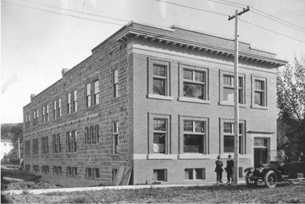
Tabor Candy Co. Ltd., circa 1914