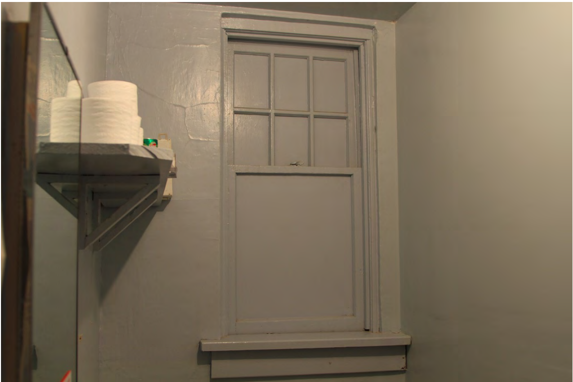
Original 6-light upper wooden sash window on interior of northeast façade, August 2014 (DLA).