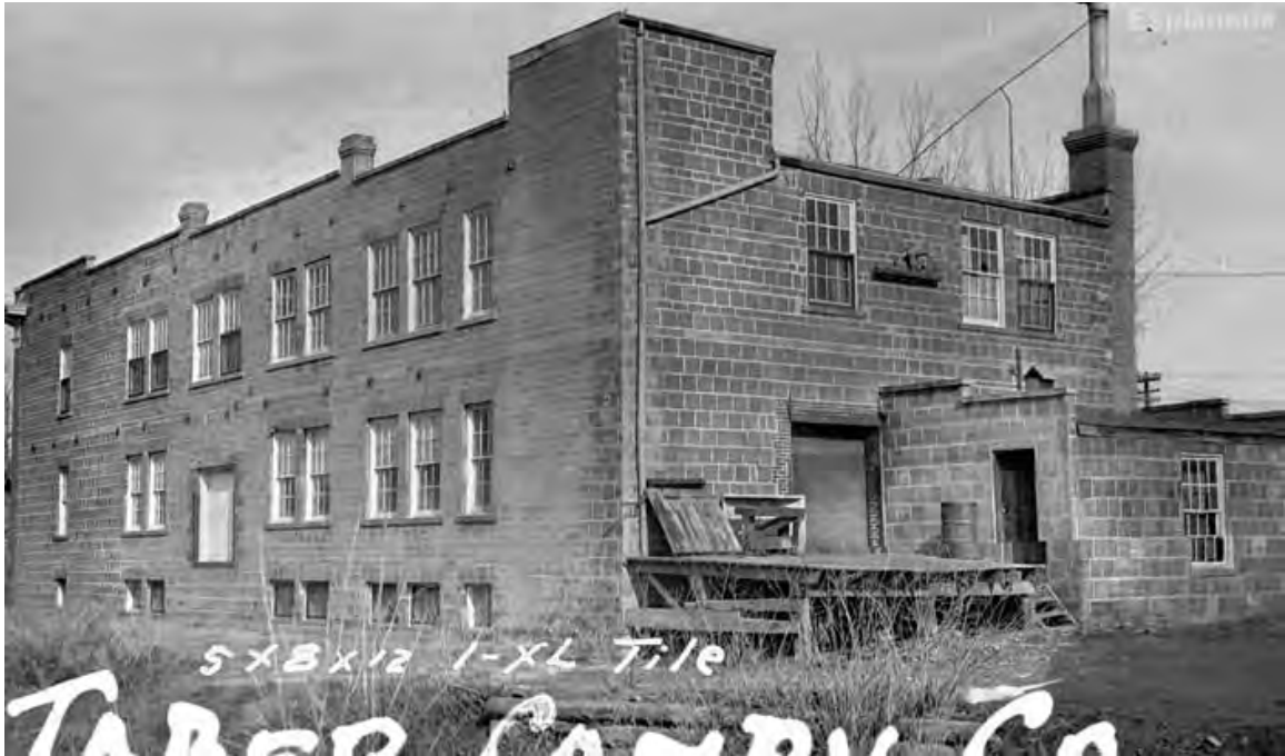
Tabor Candy Co. Ltd. rear façade, circa 1940.