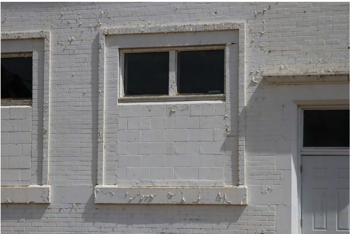
Rectangular window opening with decorative brick surround, June 2014 (DLA)