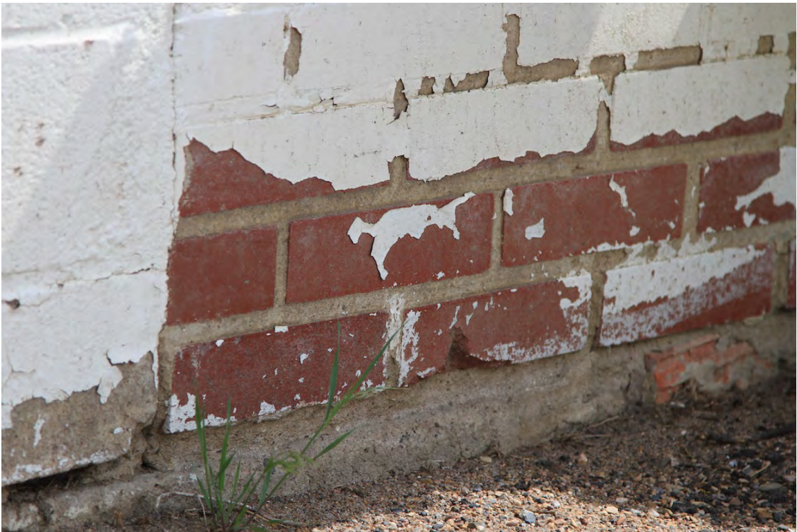
Front façade red pressed brick with flush grey mortar and concrete foundation, June 2014 (DLA)