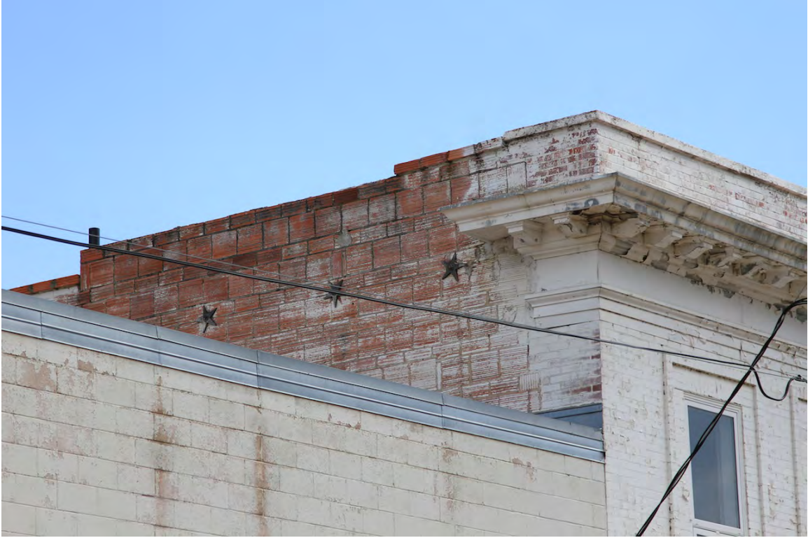
Hollow clay tile on side façade with star-shaped wall anchor plates, June 2014 (DLA)