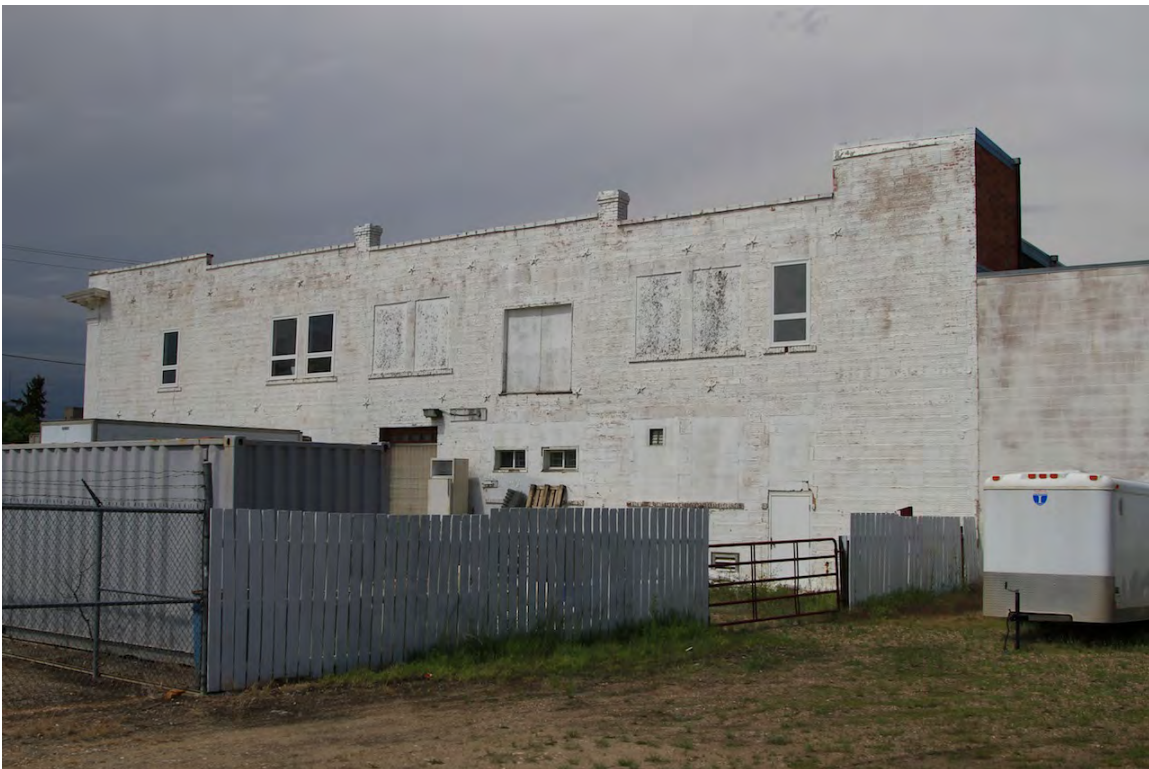
Southwest façade of Tabor Candy Co. Ltd. with hollow clay tile and multiple chimneys, June 2014