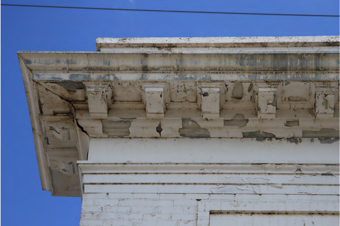
Pressed tin cornice with modillions, plain frieze, and corbelled architrave, June 2014 (DLA)