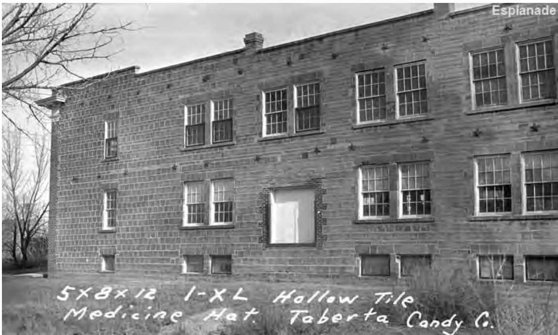
Tabor Candy Co. Ltd. southwest façade, circa 1940s (Esplanade Archives).