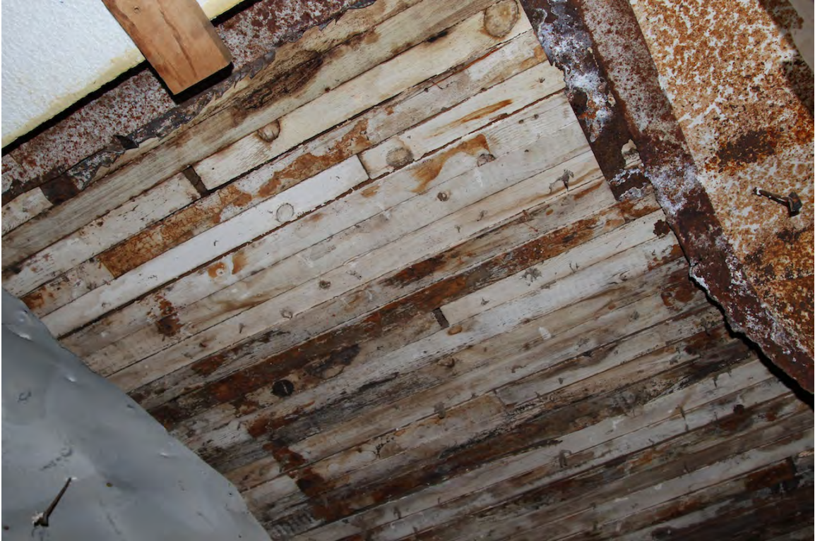
Laminated timber ceiling, August 2014