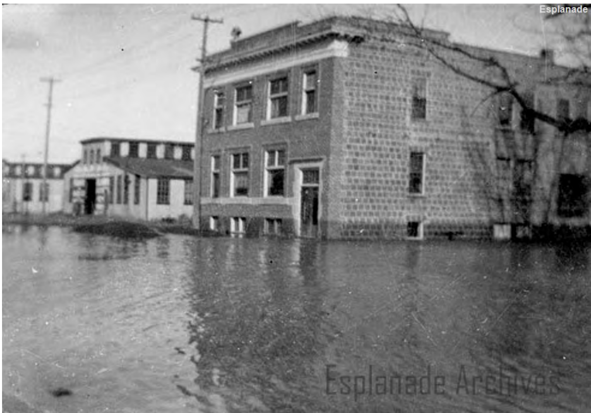
Tabor Candy Co Ltd., with Alberta Foundry and Machine Shop in the background, showing extent of 1919 flood, 1919.