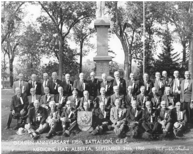
Local veterans reunite on the golden anniversary of the 175 th Canadian Expeditionary Forces (Esplanade 0099.0002)