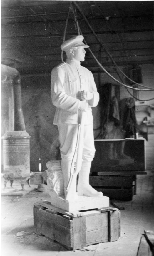
The 1.6764m (5'6") carved marble soldier c1922 (Esplanade 0899.0039)