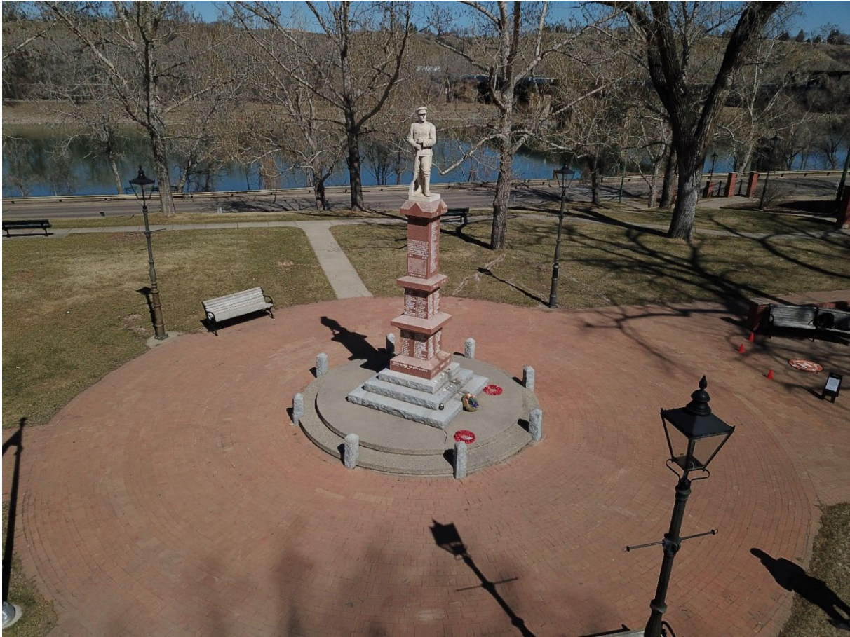
Drone photo (Marco Jansen)