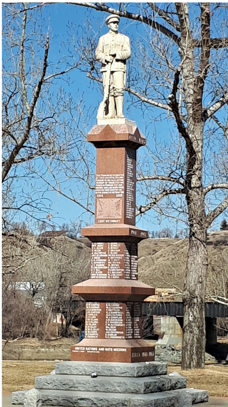
Cenotaph with North-East Crescent Heights background Mar. 18, 2021 (Sally Sehn)