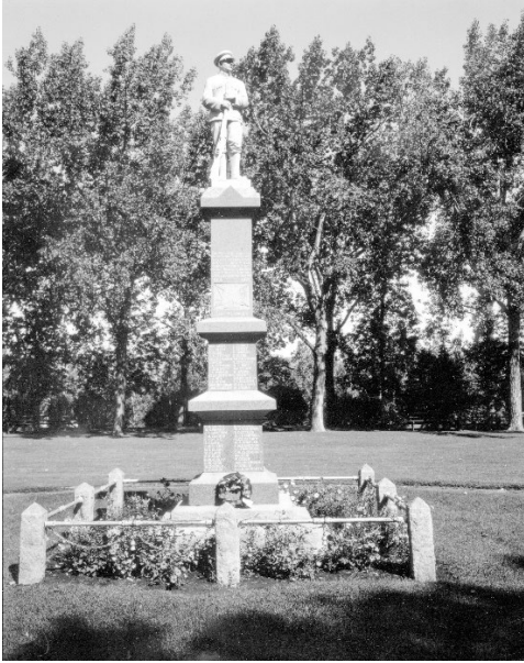
Left: Cenotaph c 1920s