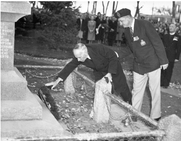
Above: Governor General Vincent Massey laying wreath at the Cenotaph, 1953