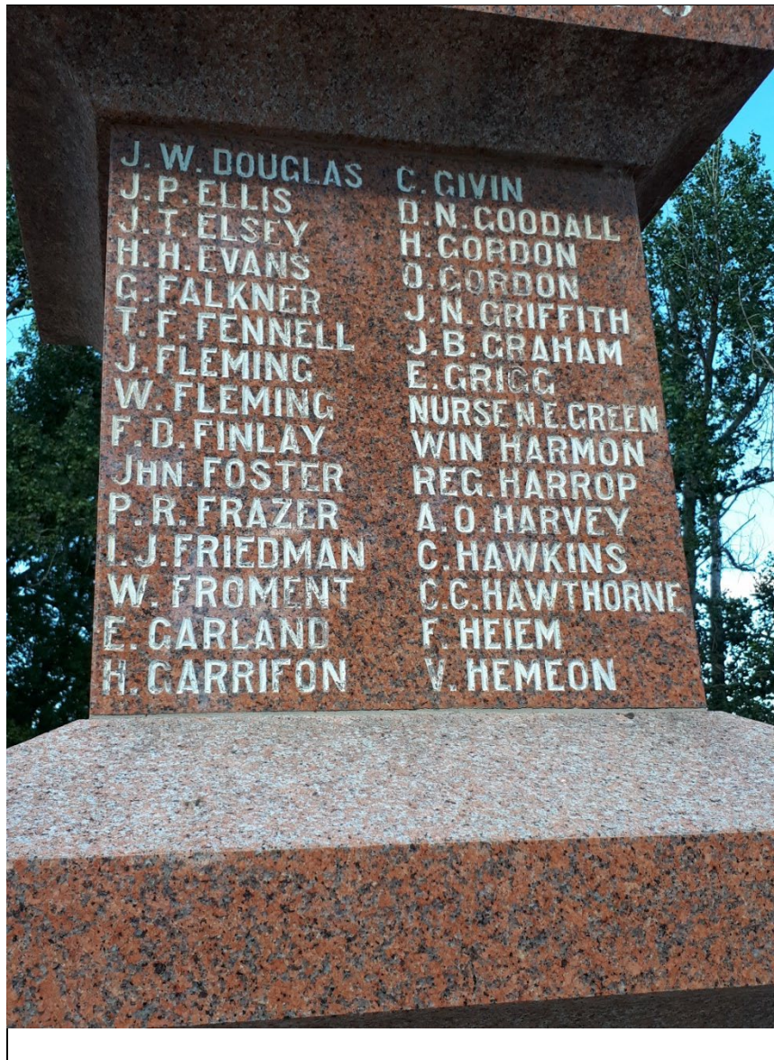
One of the WWI engraved red granite panels (Sally Sehn)