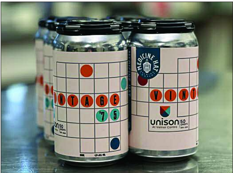
The Unison at Veiner Centre’s Bistro is selling a special brew called “Vintage 75” to celebrate the centre’s 50th anniversary. The craft beer was brewed by the Medicine Hat Brewing Company.

Medicine Hat News In celebration of providing services and support for aging adults in Medicine Hat for 50 years, the Medicine Hat Brewing Company has collaborated with the Unison at Veiner Centre to brew its very own brand of beer. The Veiner craft beer, called Vintage 75, is now available at the Bistro. A portion of all sales of Vintage will go back towards programming in Medicine Hat. “That’s one heck of a 50th anniversary gift,” reads a social media post promoting the Vintage 75. “Special thanks to Medicine Hat Brewing Company for making a delicious and inspiring beer that supports the world by our friends in Medicine Hat.”