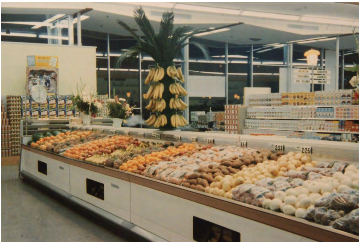
Opening day of Safeway, June 1960 (Courtesy Crescent Heights Safeway).