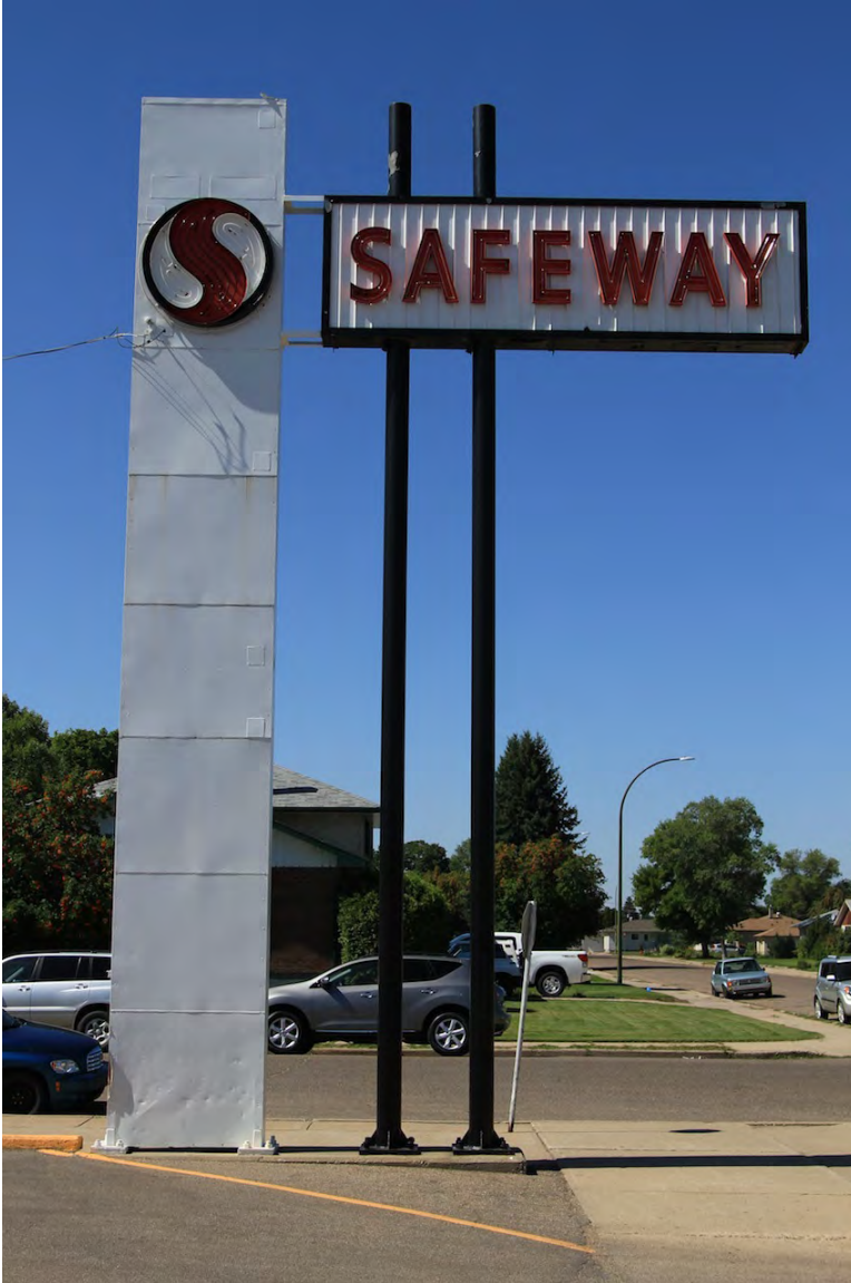
Pylon sign in parking lot (Donald Luxton & Associates, 2014)