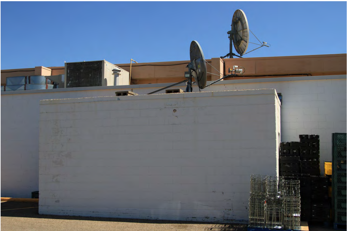
Shed addition added in 1965 (Donald Luxton & Associates, 2014)