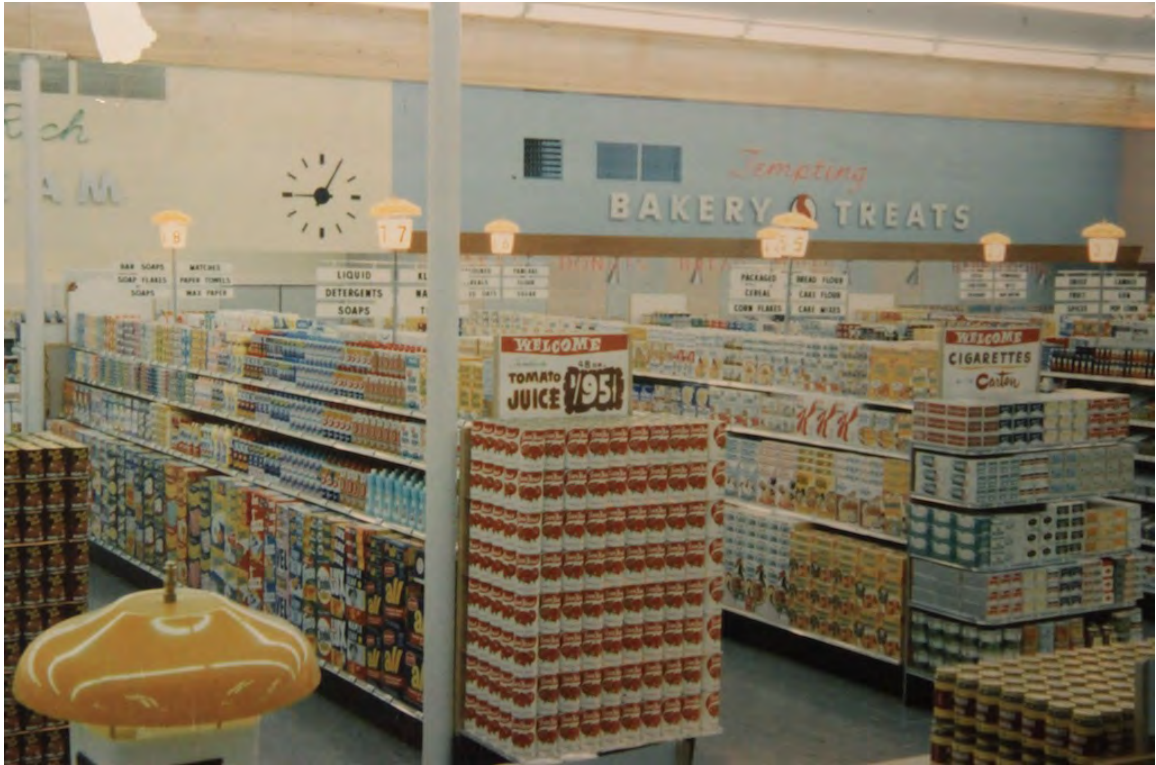
Opening day of Safeway, June 1960 (Courtesy Crescent Heights Safeway).