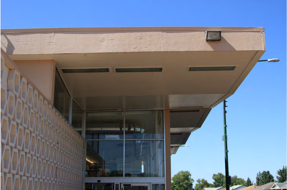
Overhanging roof showing inset lighting and lighting over side entryway, facing west (Donald Luxton & Associates, 2014)