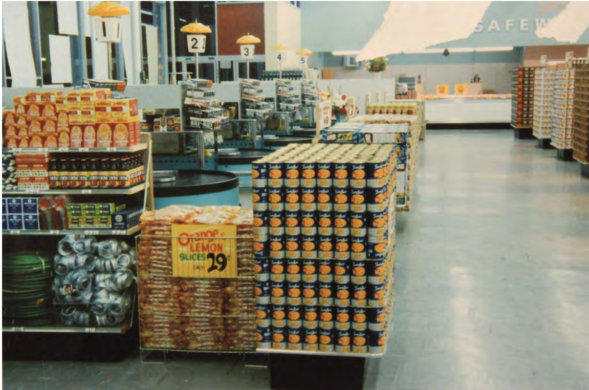
Opening day of Safeway, June 1960 (Courtesy Crescent Heights Safeway).