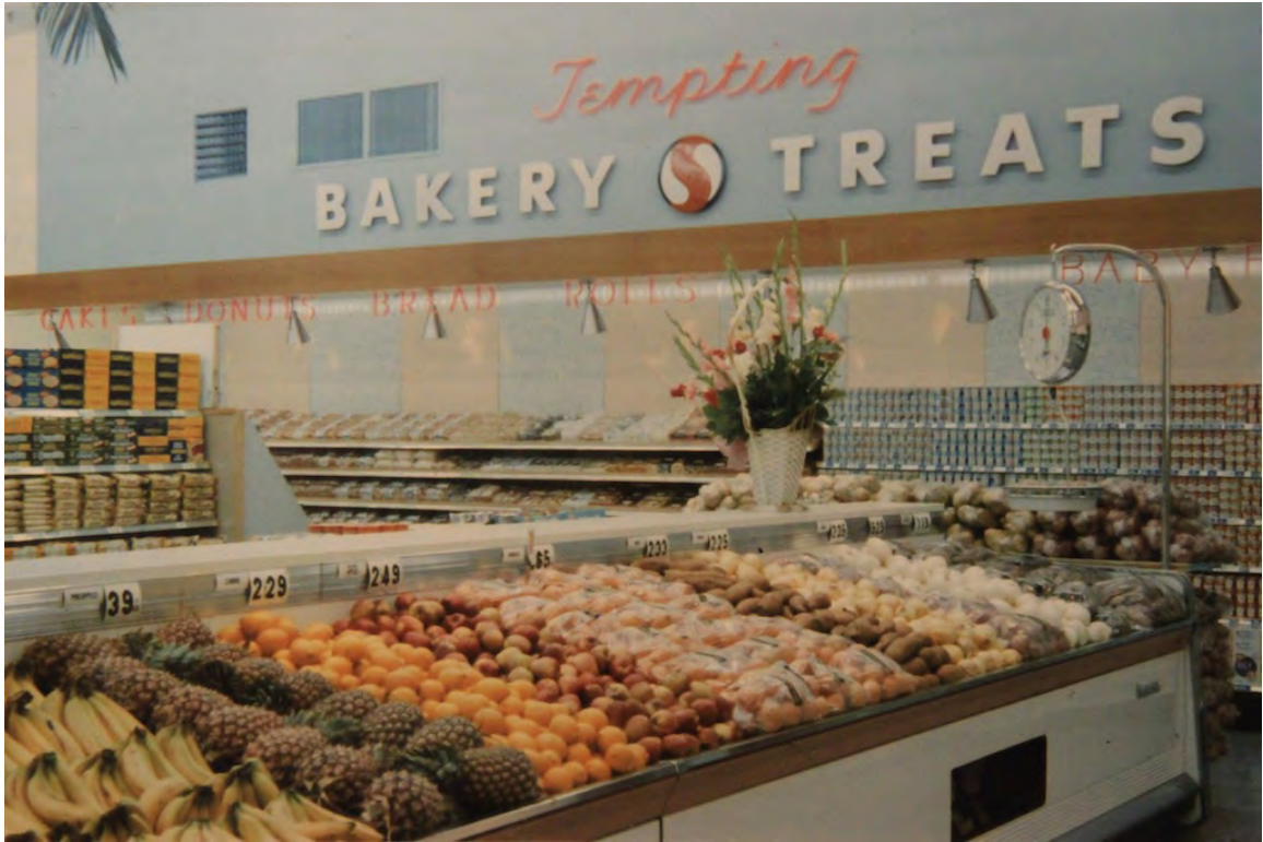
Opening day of Safeway, June 1960.