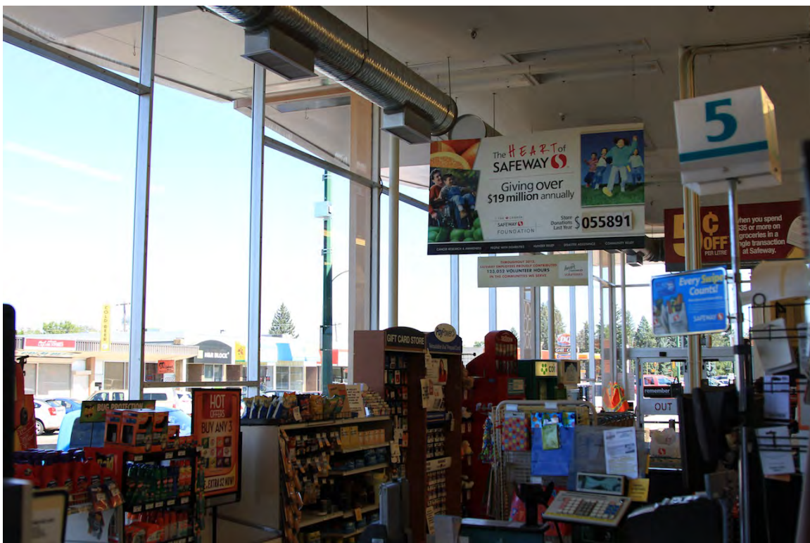
Interior of building showing front tills and glazing (Donald Luxton & Associates, 2014).