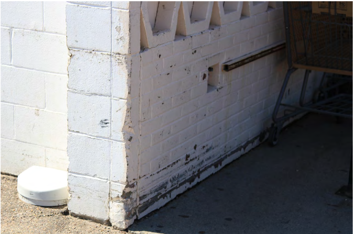
Damage to brick veneer and concrete wall, east side, by grocery carts (Donald Luxton & Associates, 2014)