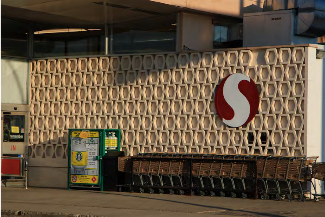
Close-up of the hexagonal breezeblock (Donald Luxton & Associates, 2014)