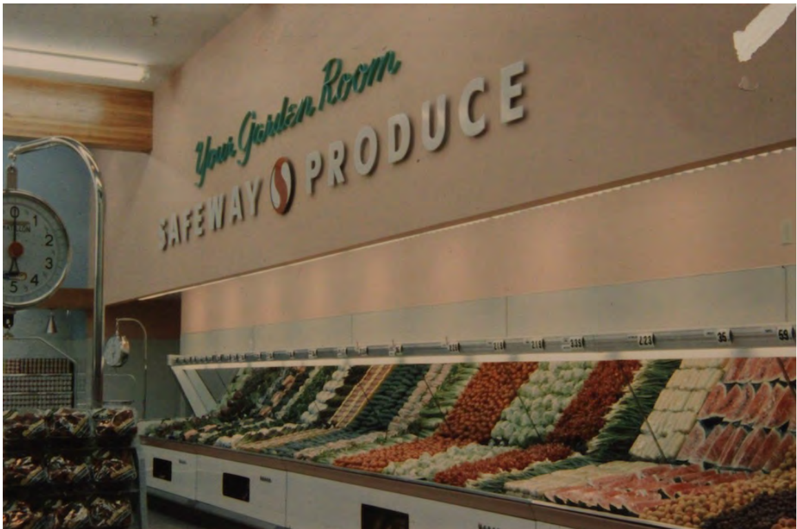
Opening day of Safeway, June 1960 (Courtesy Crescent Heights Safeway).