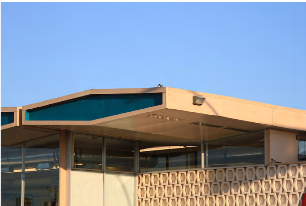
Close-up of the hexagonal thin shell concrete roof (Donald Luxton & Associates, 2014)