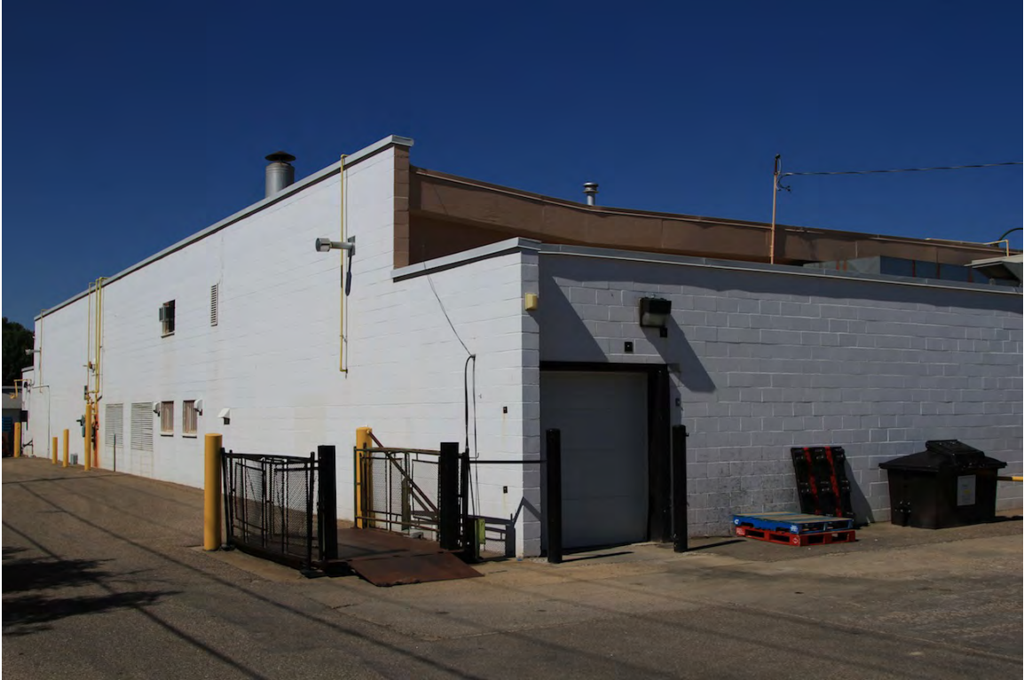
Rear (south) of building (Donald Luxton & Associates, 2014)