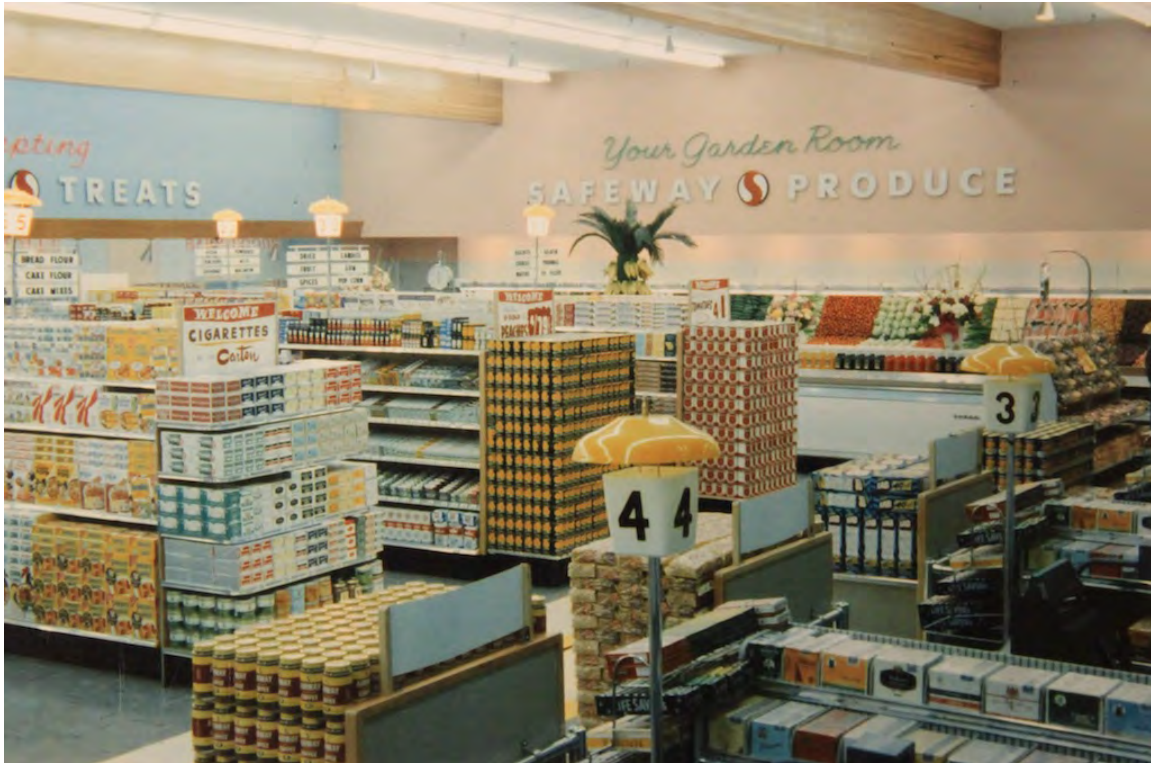
Opening day of Safeway, June 1960 (Courtesy Crescent Heights Safeway).