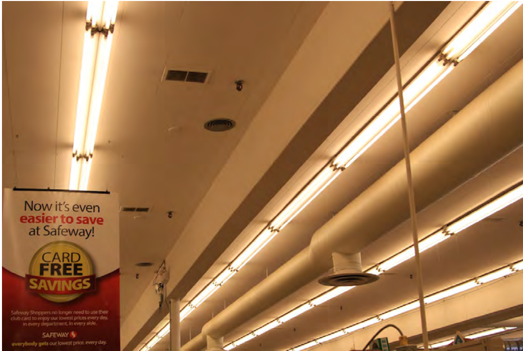
Interior exposed glulam beams and new HVAC (Donald Luxton & Associates, 2014).