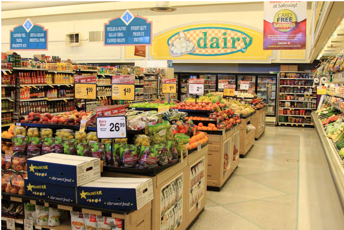
Interior of building (Donald Luxton & Associates, 2014).