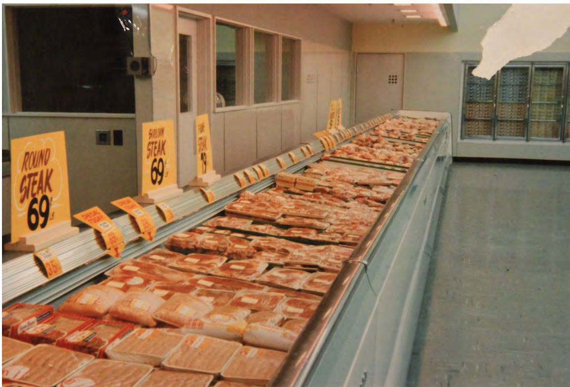
Opening day of Safeway, June 1960 (Courtesy Crescent Heights Safeway).