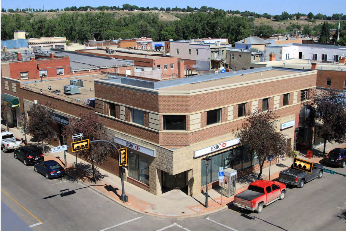
View of flat roof and one and two-storey sections of F.W. Woolworth Store, 2014 (DLA)