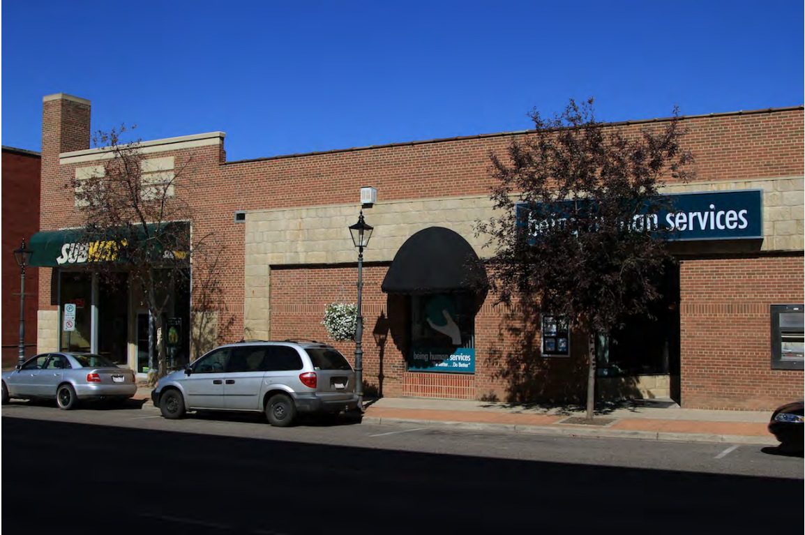
West façade of F. W. Woolworth Store with faux sandstone tile, 2014 (DLA)