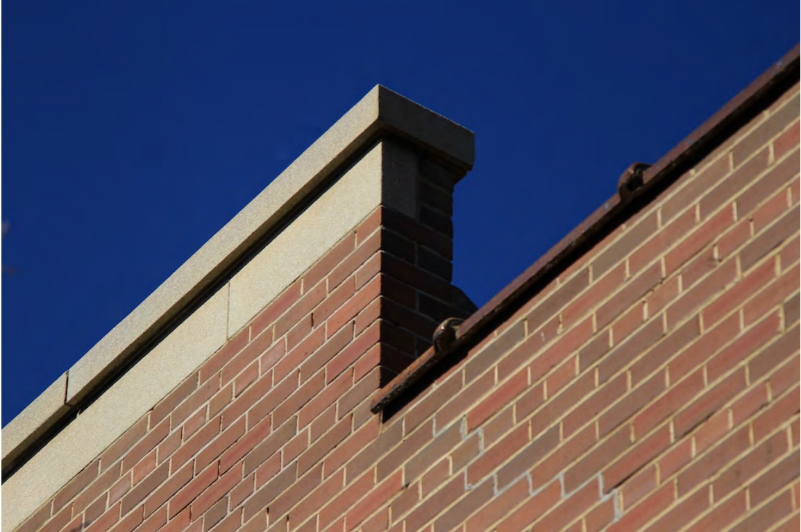
Red pressed brick parapet with concrete parapet cap, 2014 (DLA)