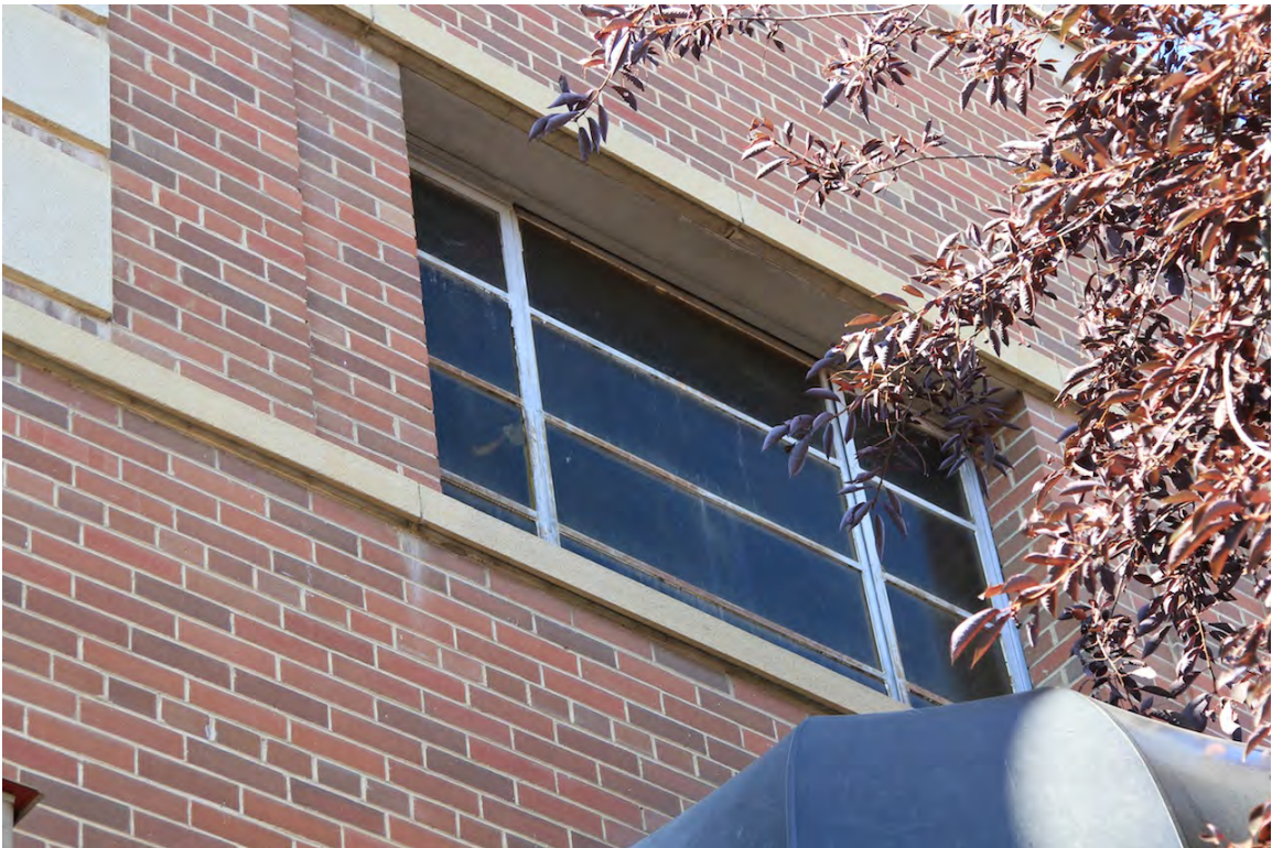
Sole remaining original metal sash window, 2014 (DLA)