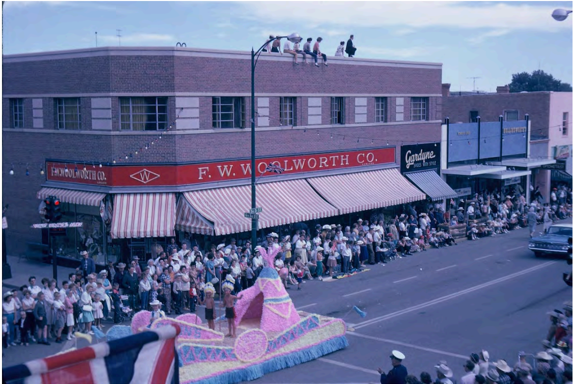
F. W. Woolworth Store during Stampede Parade, 1962