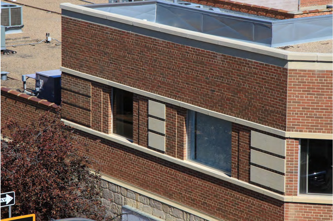
Rectangular window openings with replaced sashes, 2014 (DLA)