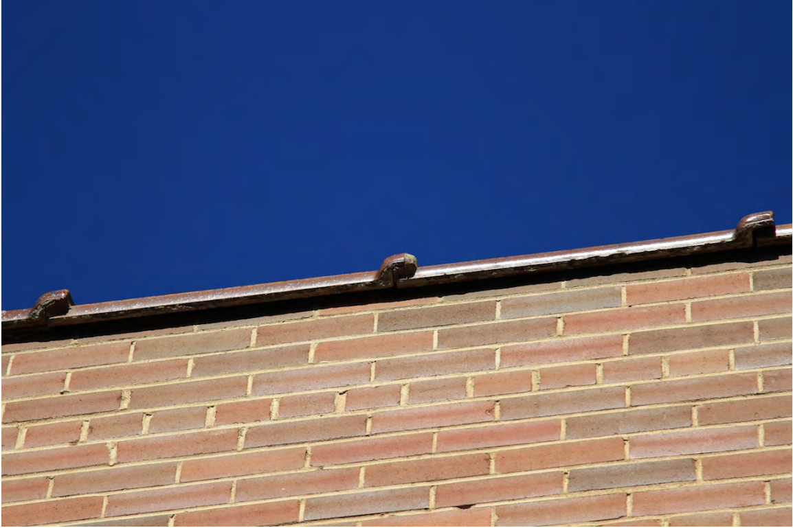
Parapet cap with common bond red pressed brick below, 2014 (DLA)