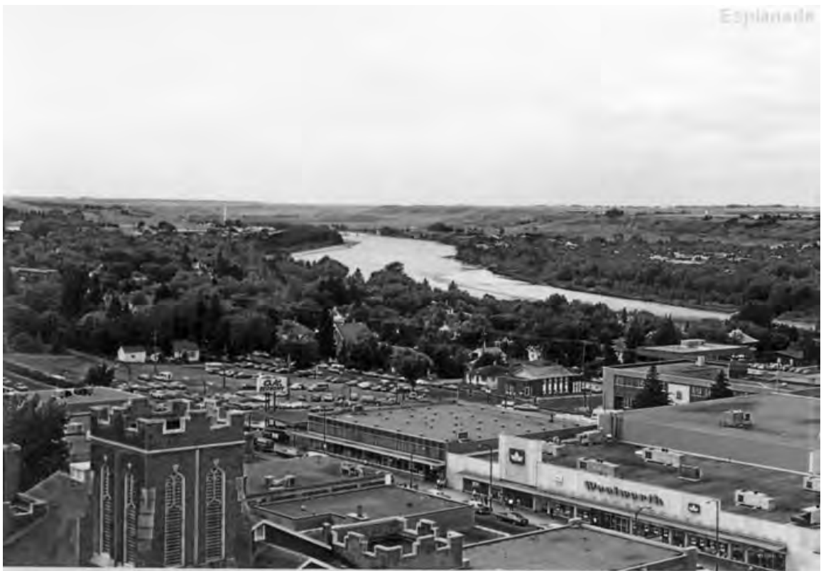
Relocated Woolworth store at 450 3 rd Street SE, date unknown