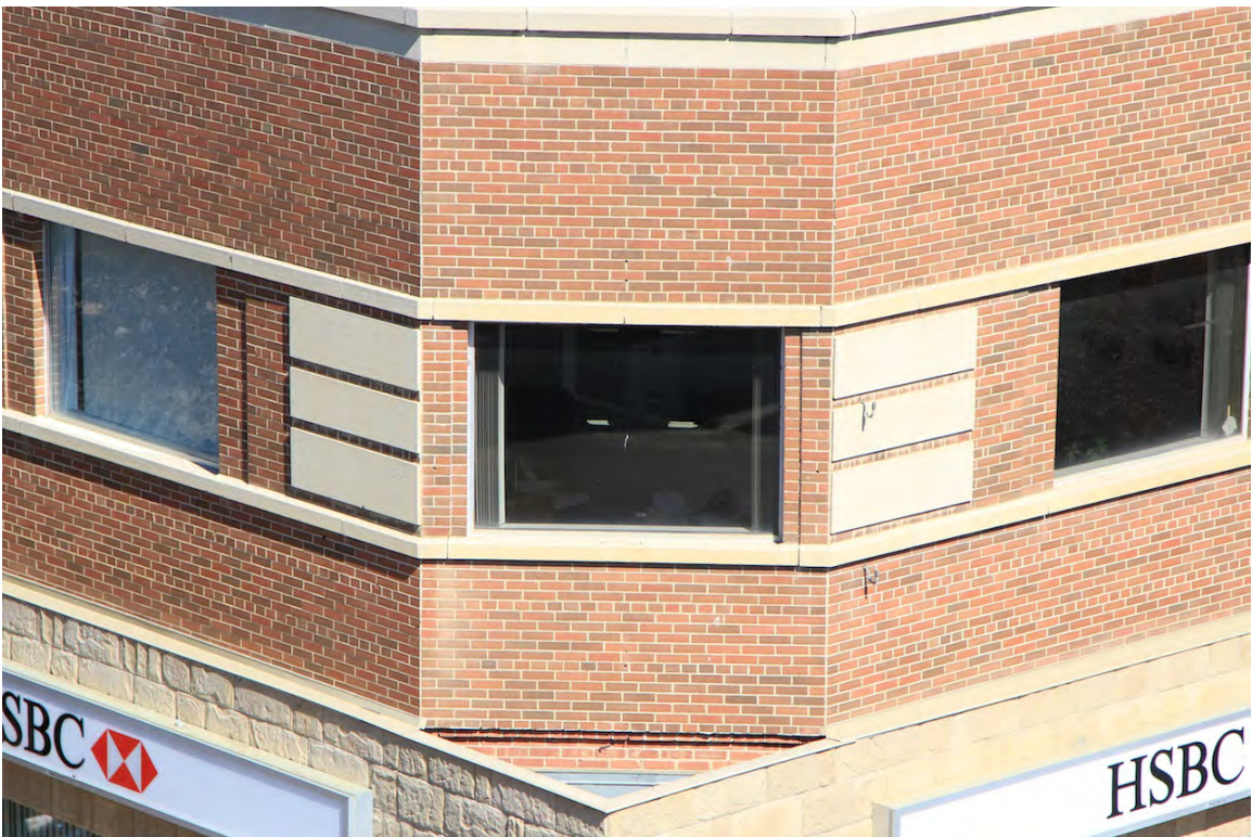
Second storey chamfered corner with window lintel and sill concrete banding and decorative rectangular concrete elements, 2014 (DLA)