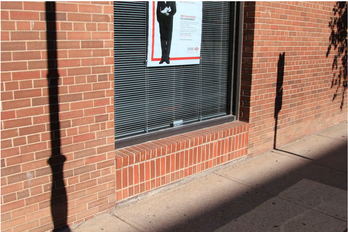
New storefront opening, 2014 (DLA)