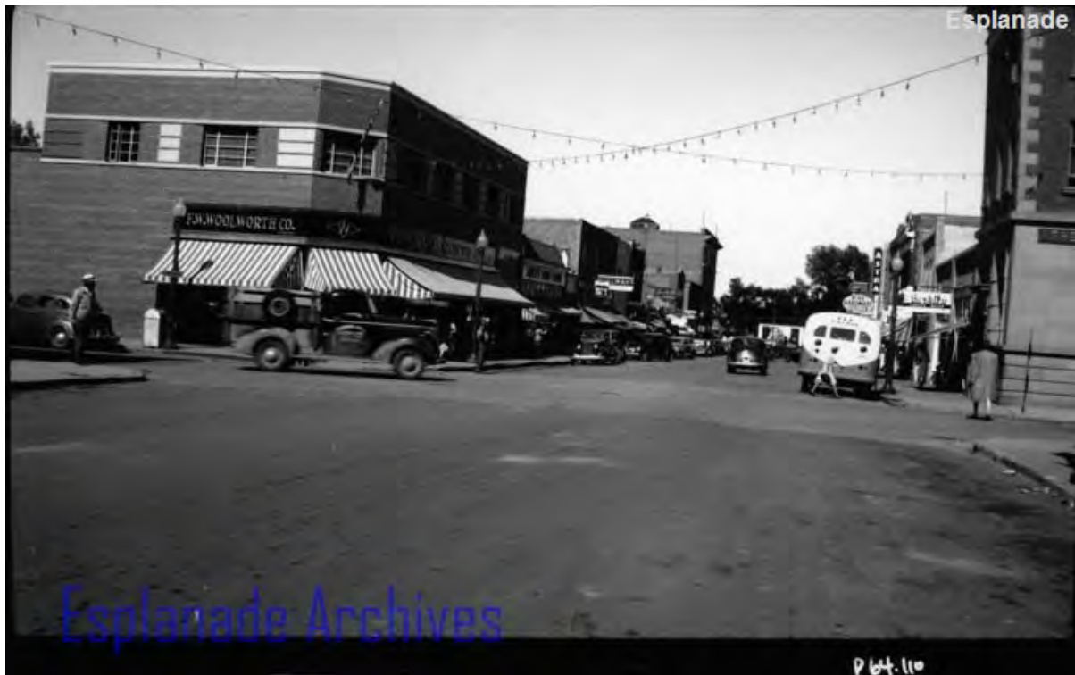
F.W. Woolworth Store, unknown date