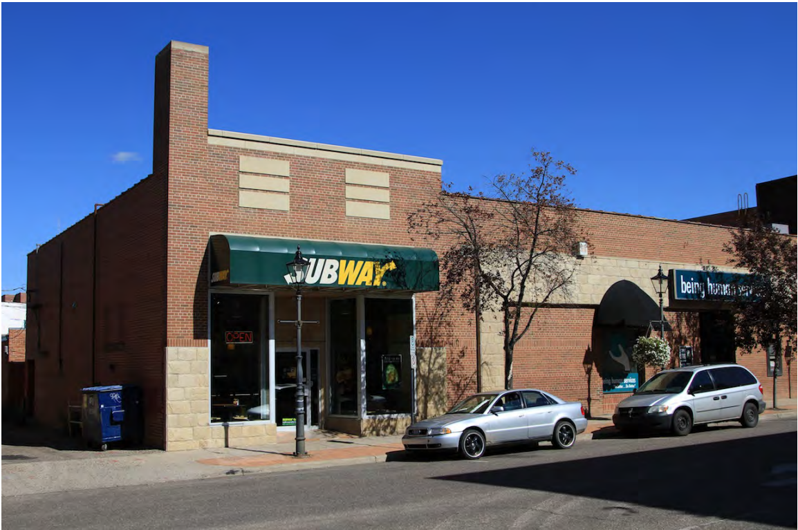
Original parapet with chimney incorporated at corner and rectangular concrete details, 2014 (DLA)