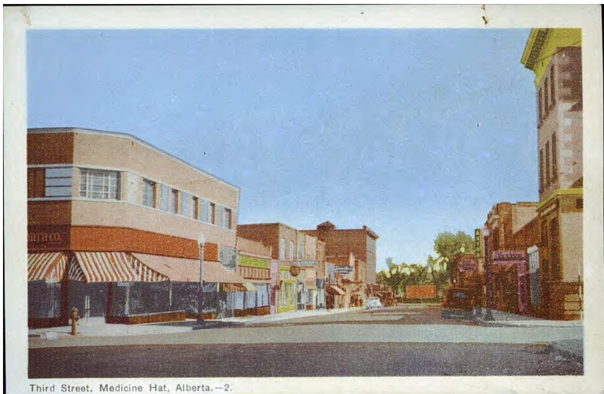
Historic postcard of Third Street, F. W. Woolworth Store at left, 1940 (Peel's Prairie Provinces)