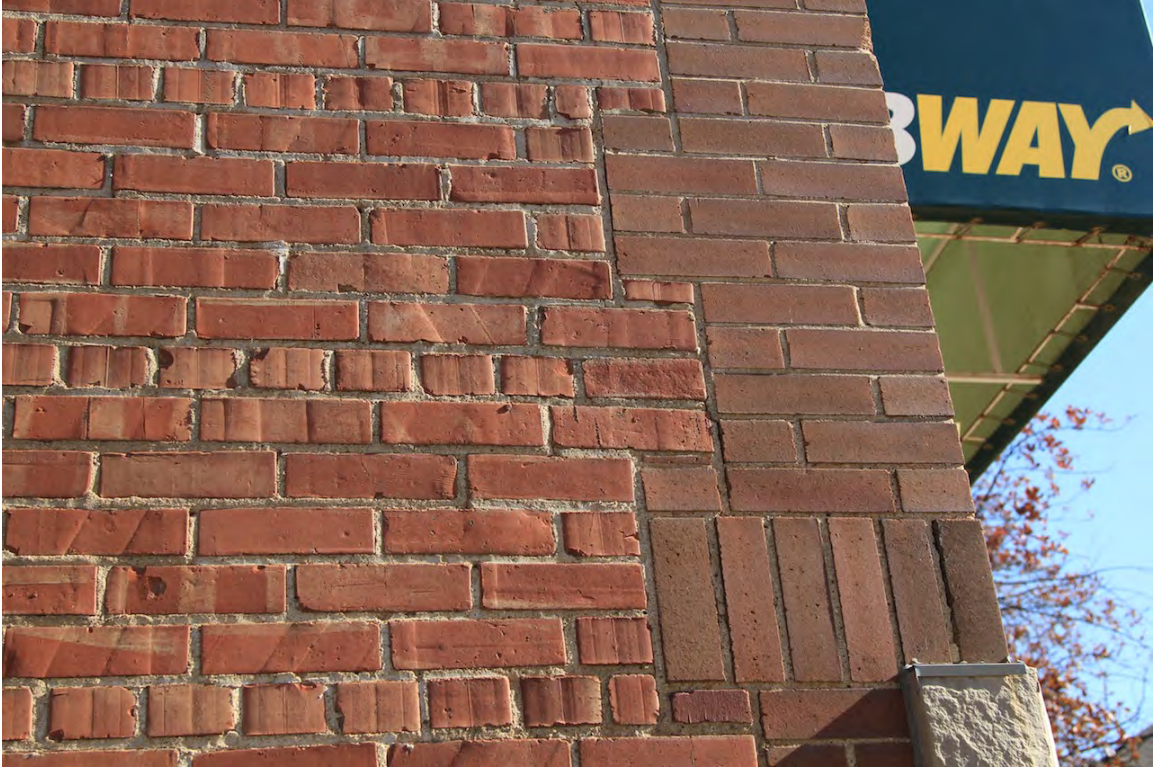
Variation in brick between public and non-public façades, 2014 (DLA)