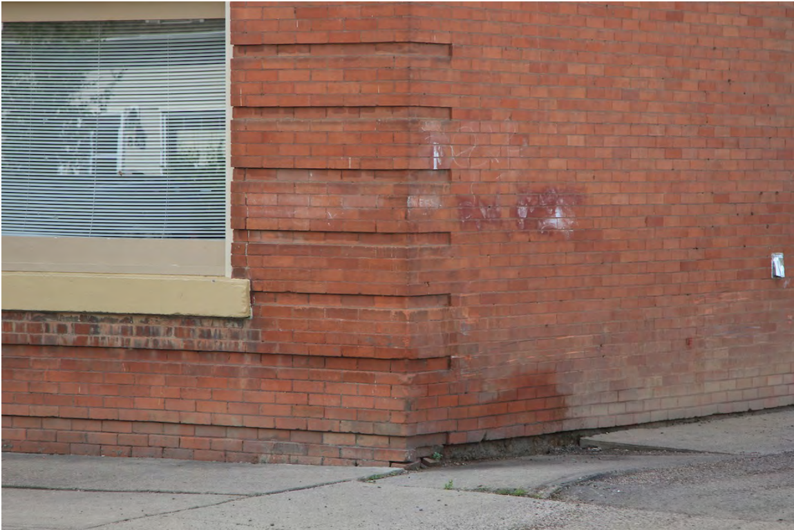
Brick banding at first floor of front façade, 2014 (DLA)