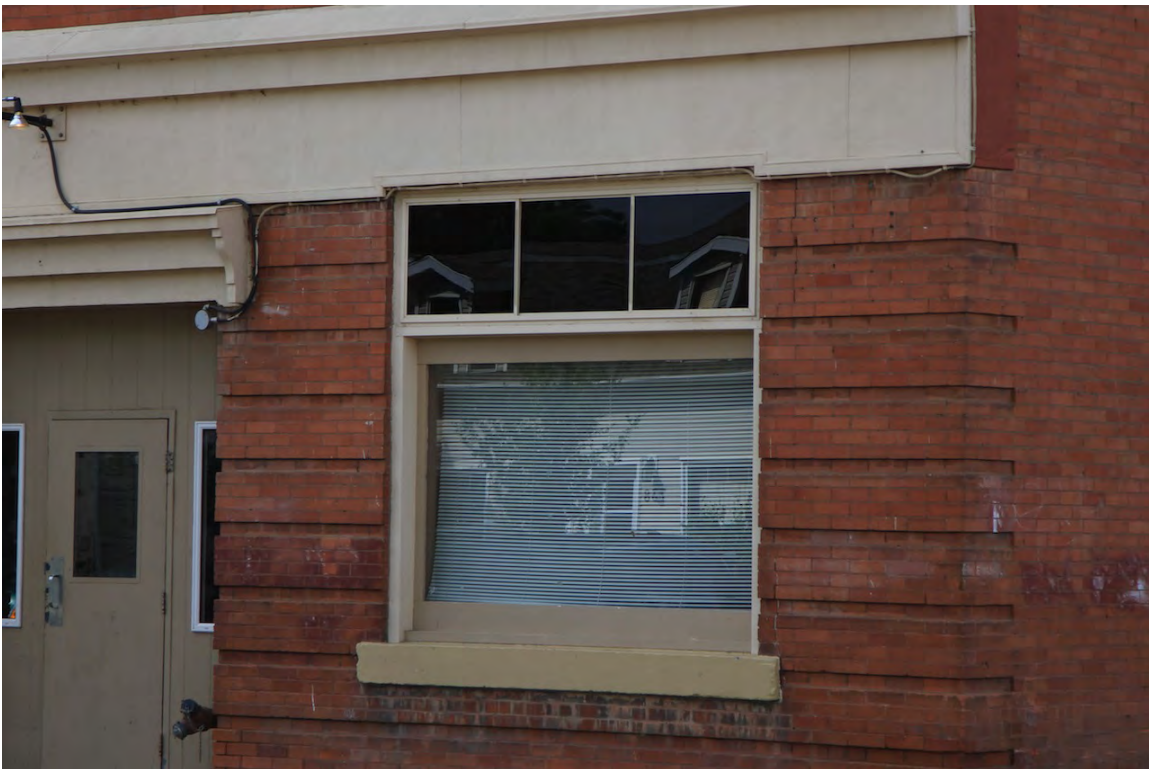
Replaced window, transom, storefront cornice, and door XXX on front façade, 2014 (DLA)