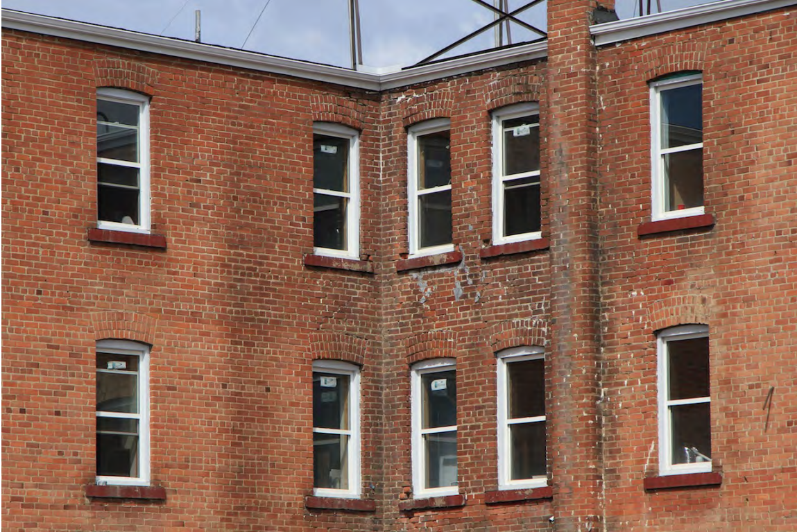
East and south façades with voussoir brick on segmental arch windows with parged sills, windows replaced. Extensive staining and past repairs evident, 2014 (DLA)