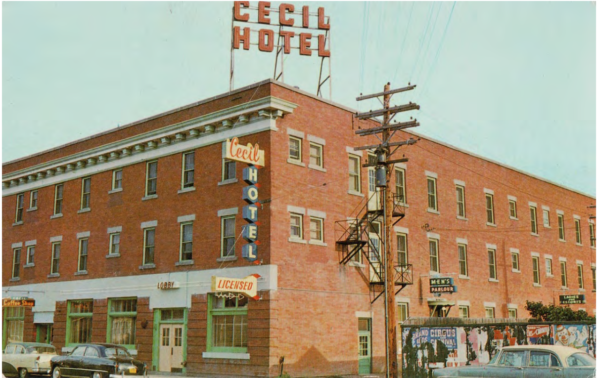
Cecil Hotel, unknown date