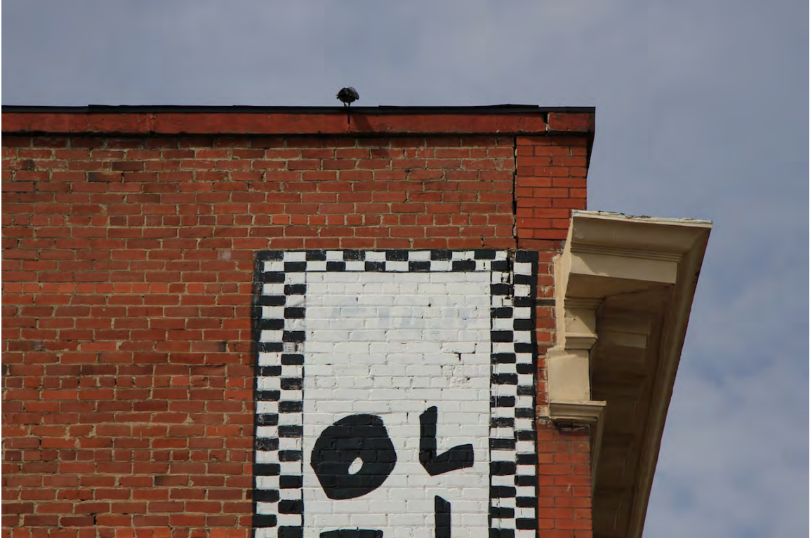
Common bond brick on east façade, 2014 (DLA)