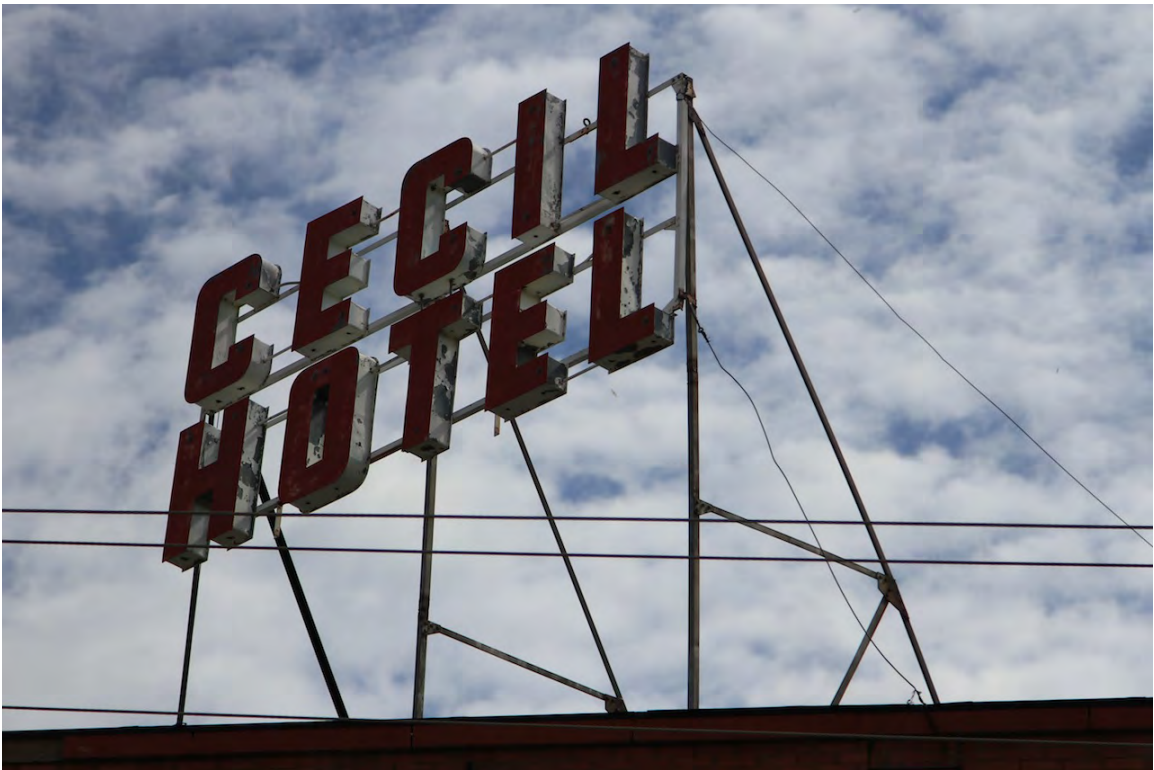
Rooftop "Cecil Hotel" sign, 2014 (DLA)