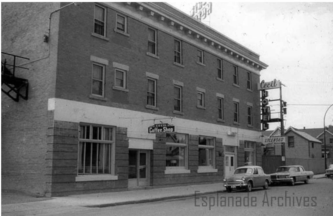
Cecil Hotel, 1965