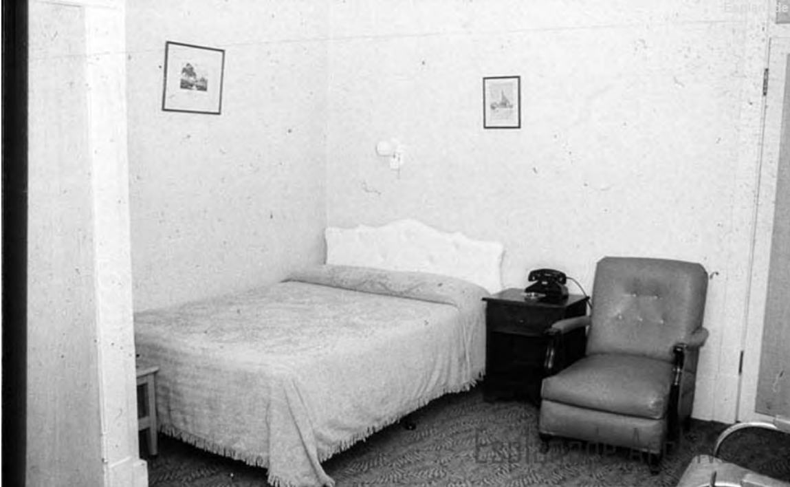
Hotel room Cecil Hotel, 1965