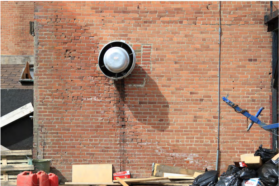
Exhaust fan with extensive damage to adjacent brick and past unsympathetic repairs, 2014 (DLA)