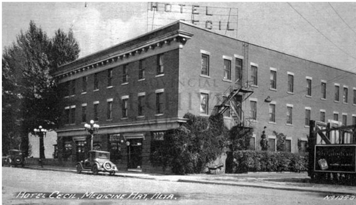
Historic Hotel Cecil postcard, circa 1920s, (Provincial Archives of Alberta)