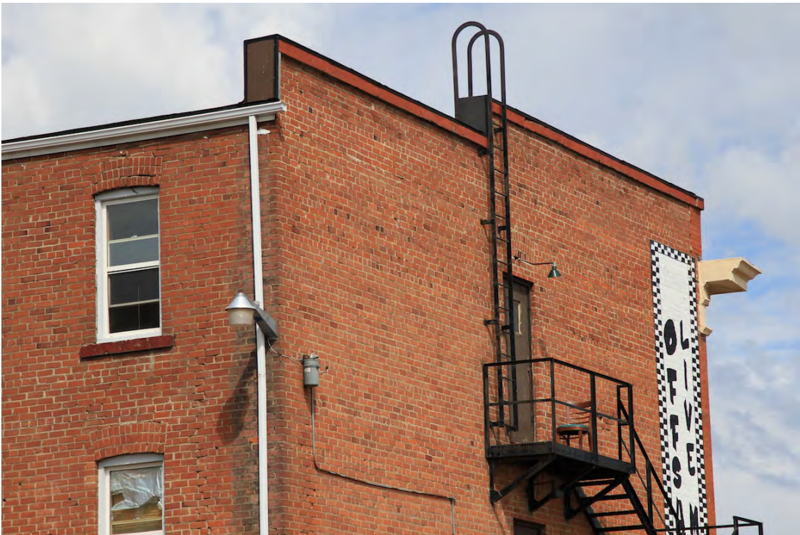
Stepped parapet, 2014 (DLA)