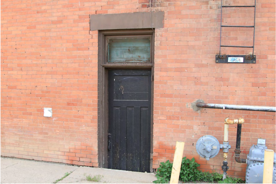
Original height of west entry with original panelled wooden door and glass transom, 2014 (DLA)