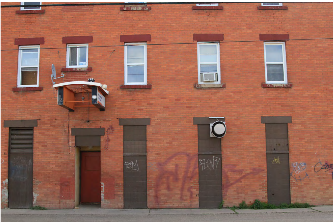
Infilled window openings (first floor), resized window opening (second floor), and all windows replaced on west façade, 2014 (DLA)