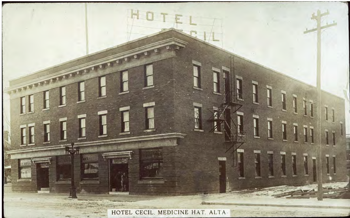
Historic Hotel Cecil postcard, circa 1910s