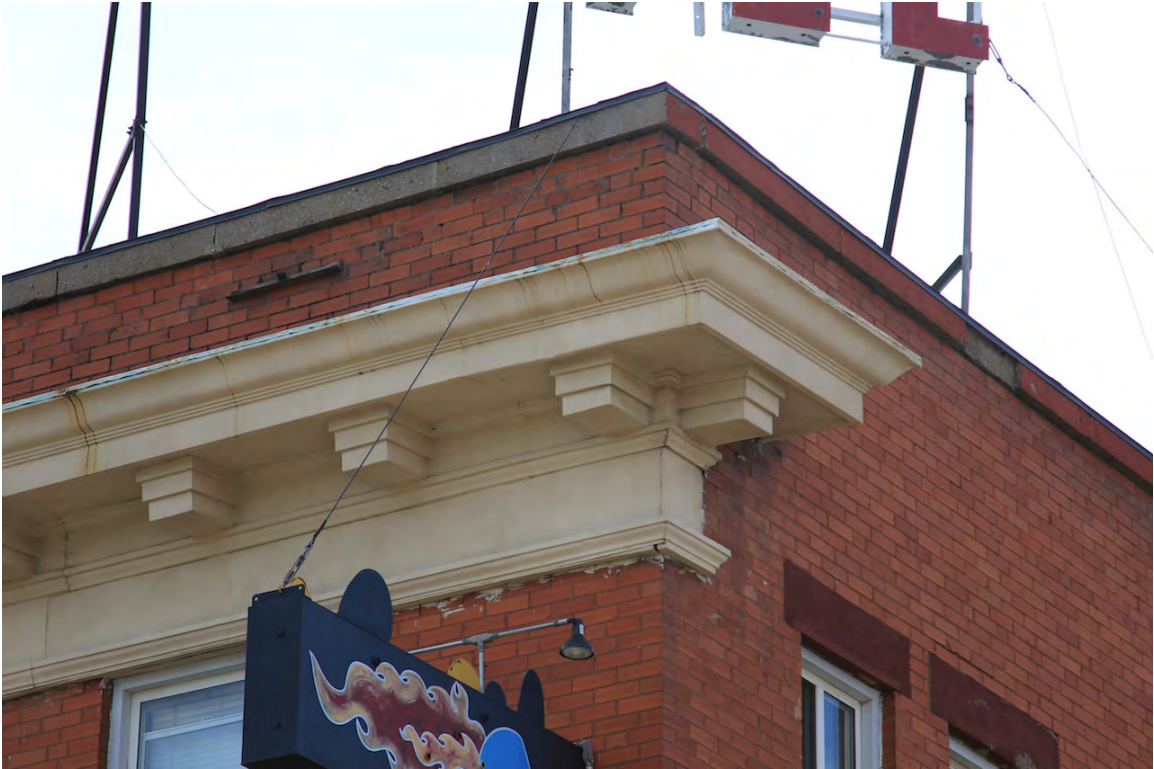
Rooftop cornice with modillions below brick parapet, 2014 (DLA)