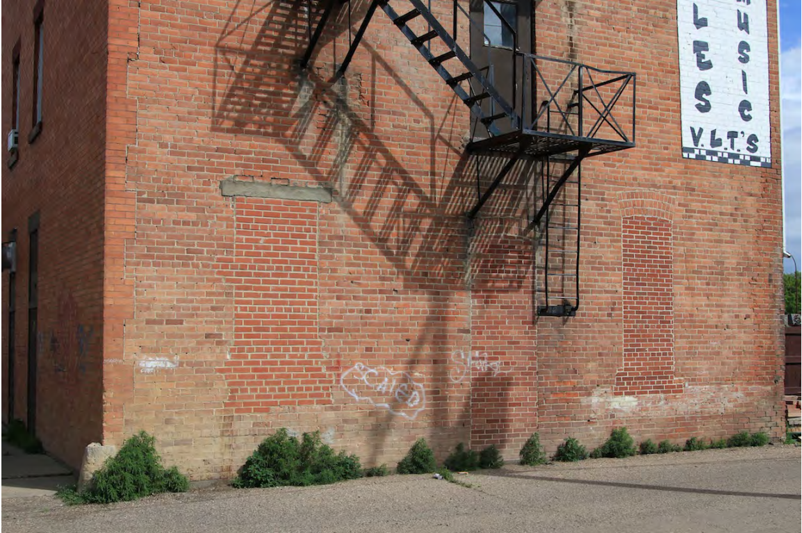
Infilled original window and door openings on south façade, 2014