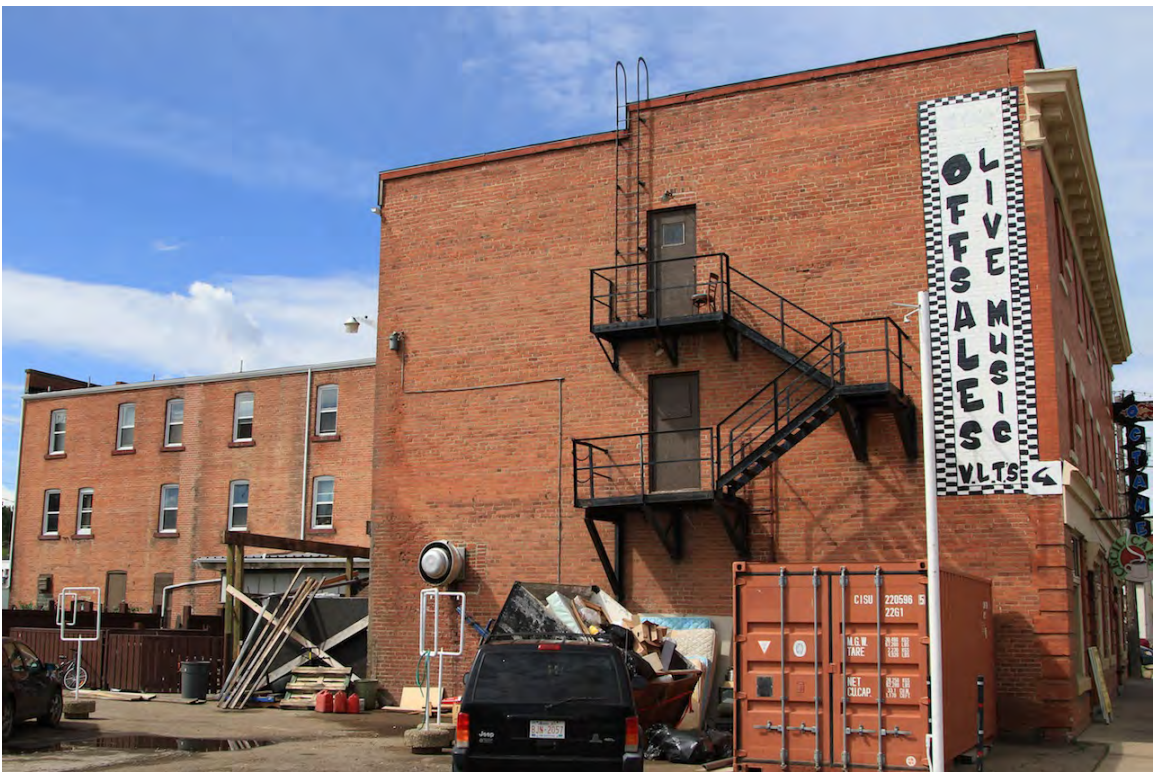
East façade with resized emergency exit door openings, 2014 (DLA)