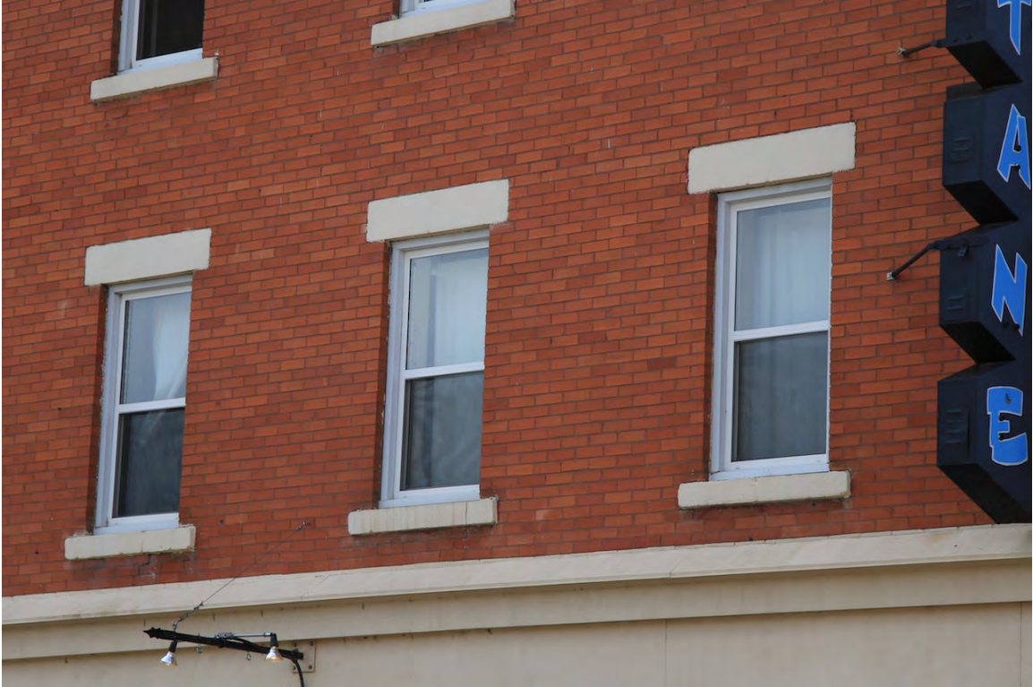
Regular rectangular window openings with parged sills and lintels on front façade, window replaced, 2014 (DLA)