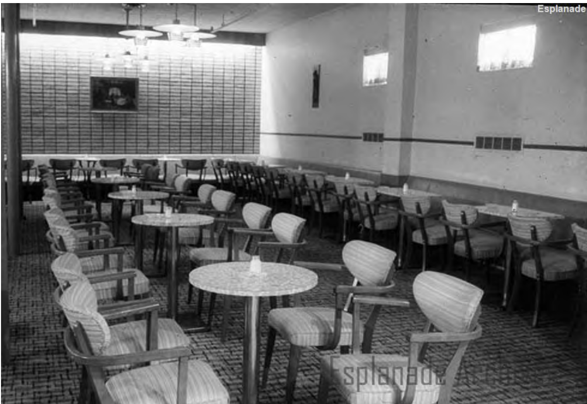
Cecil Hotel lounge, 1965