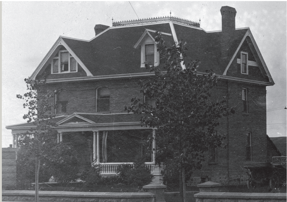
The Becker Cocks Residence as it appeared circa 1913

Prominently located on the tree-lined historic 1st Street SE, the residence is valued as a highly visible landmark in the Medicine Hat community with distinctive architectural and landscape features.