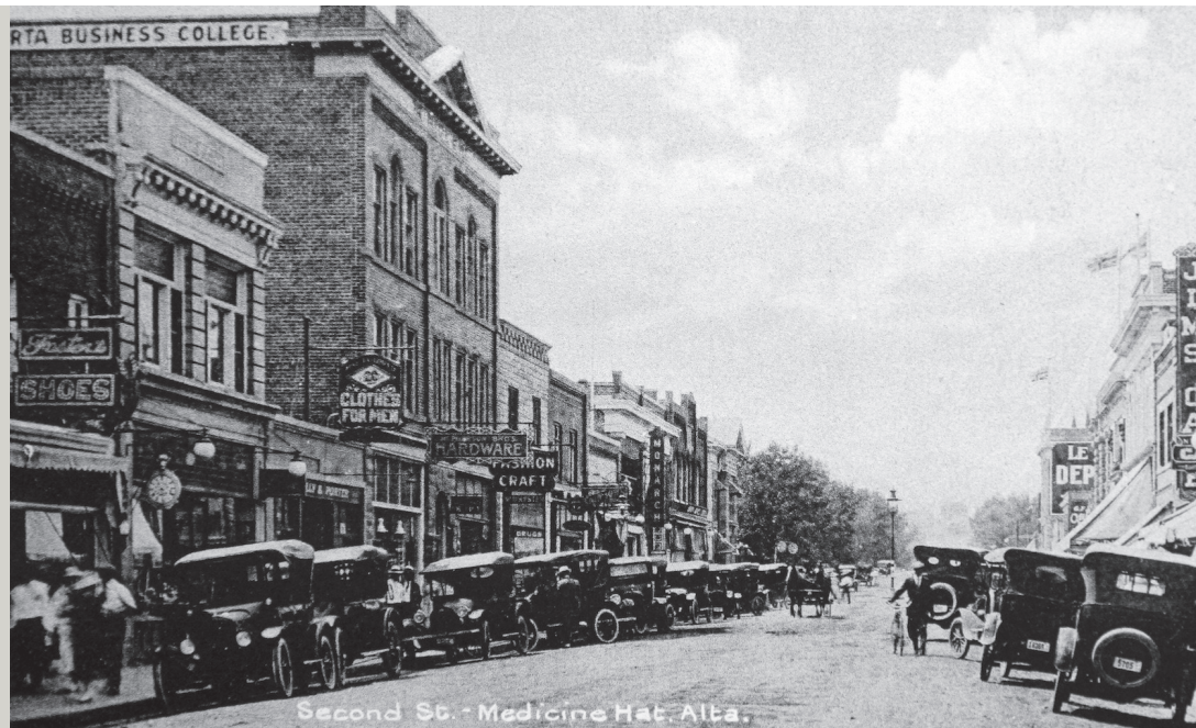
Photogelatine Engravings Co. Ltd. Second St. - Medicine Hat. Alta. Souvenir of Medicine Hat, Alberta