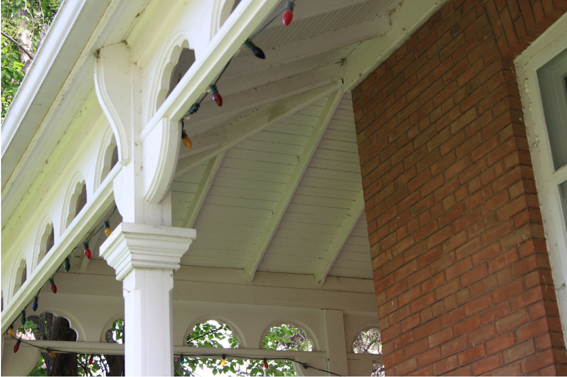
Verandah detailing showing open soffits with exposed rafters (Donald Luxton & Associates, 2014).