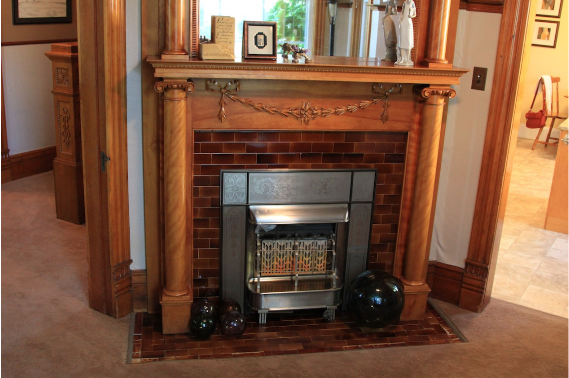
Oak fireplace mantel from Sears Roebuck catalogue in library.