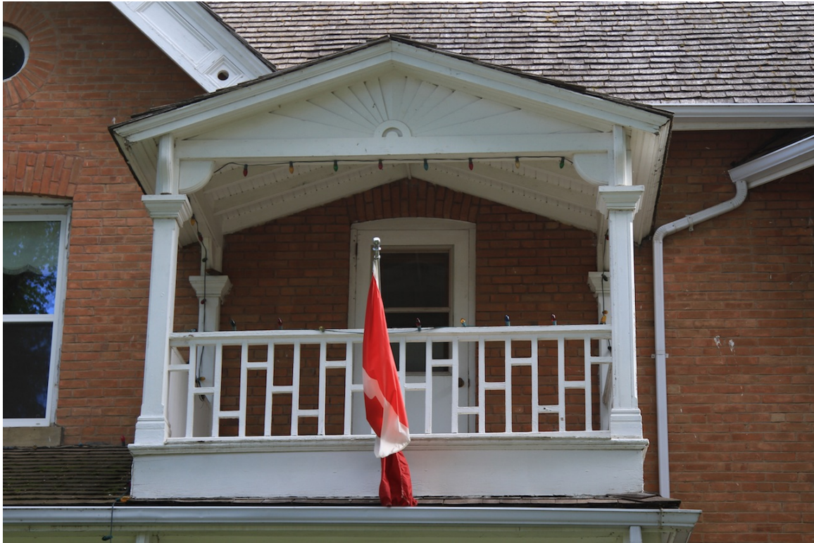
Second storey balcony showing starburst gable screen