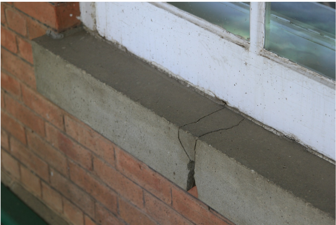
Cracking on concrete sills (Donald Luxton & Associates, 2014).