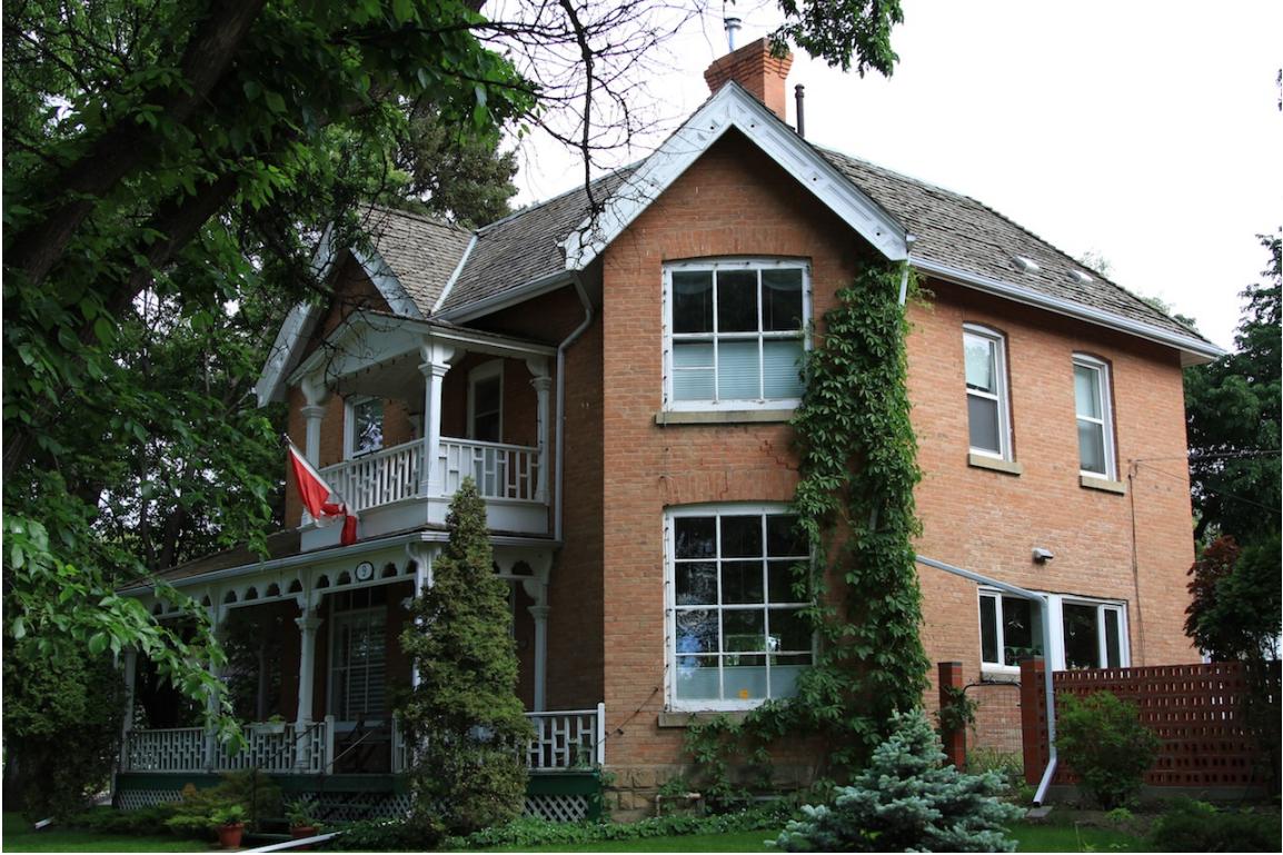
View of full height bay (Donald Luxton & Associates, 2014).