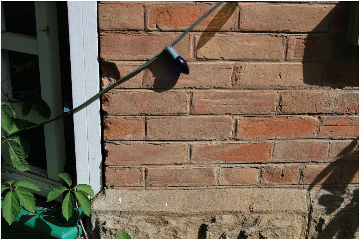
Areas of chipped brick (angled bay) (Donald Luxton & Associates, 2014).