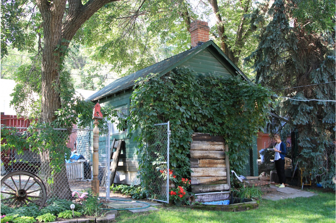
Rear 1917 garage (Donald Luxton & Associates, 2014).