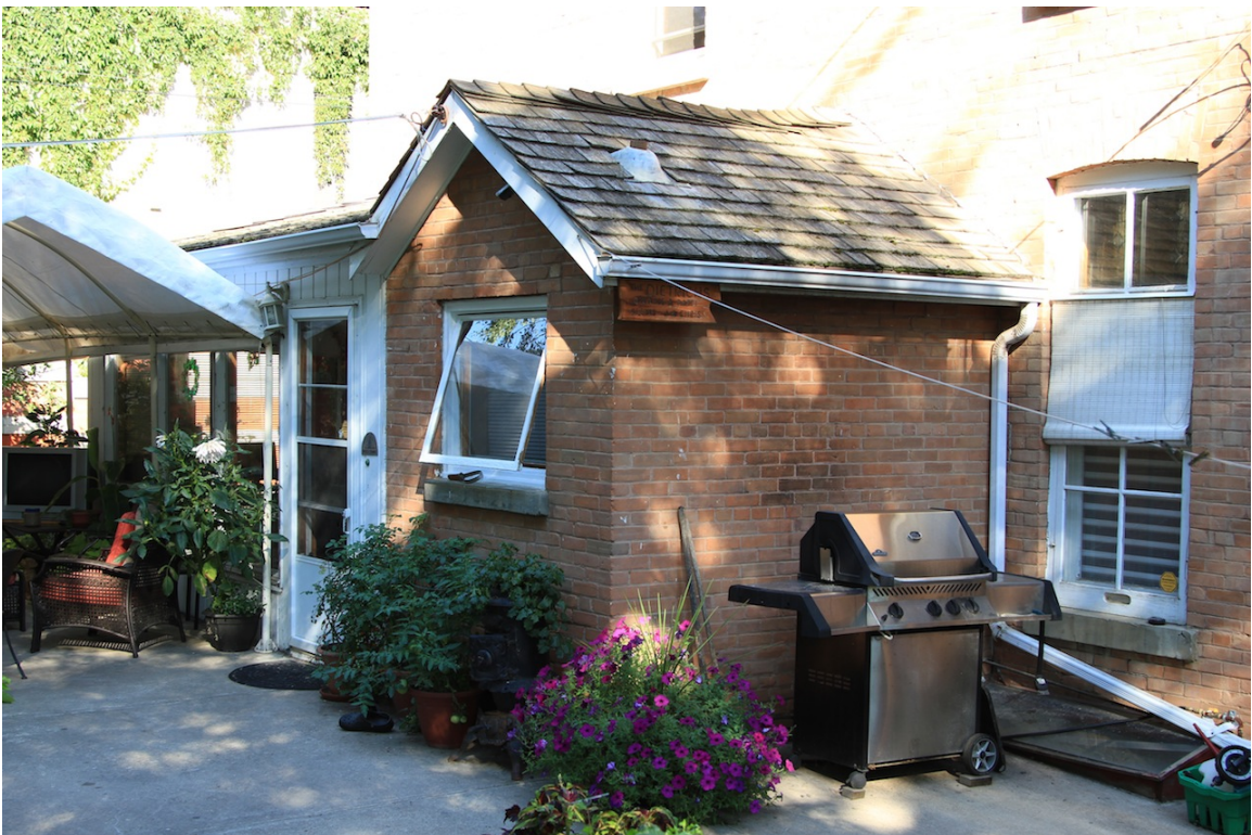
Gabled entryway at back of residence (original) and 1959 sunroom (Donald Luxton & Associates, 2014).