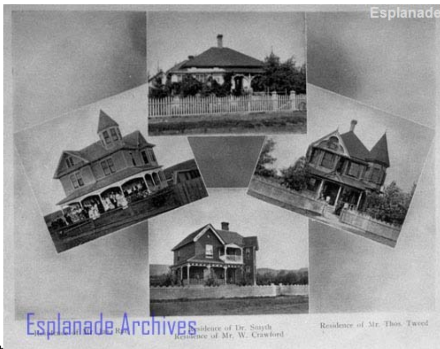
+ Crawford Dietrich Residence bottom centre, circa 1900s (Esplanade Archives).