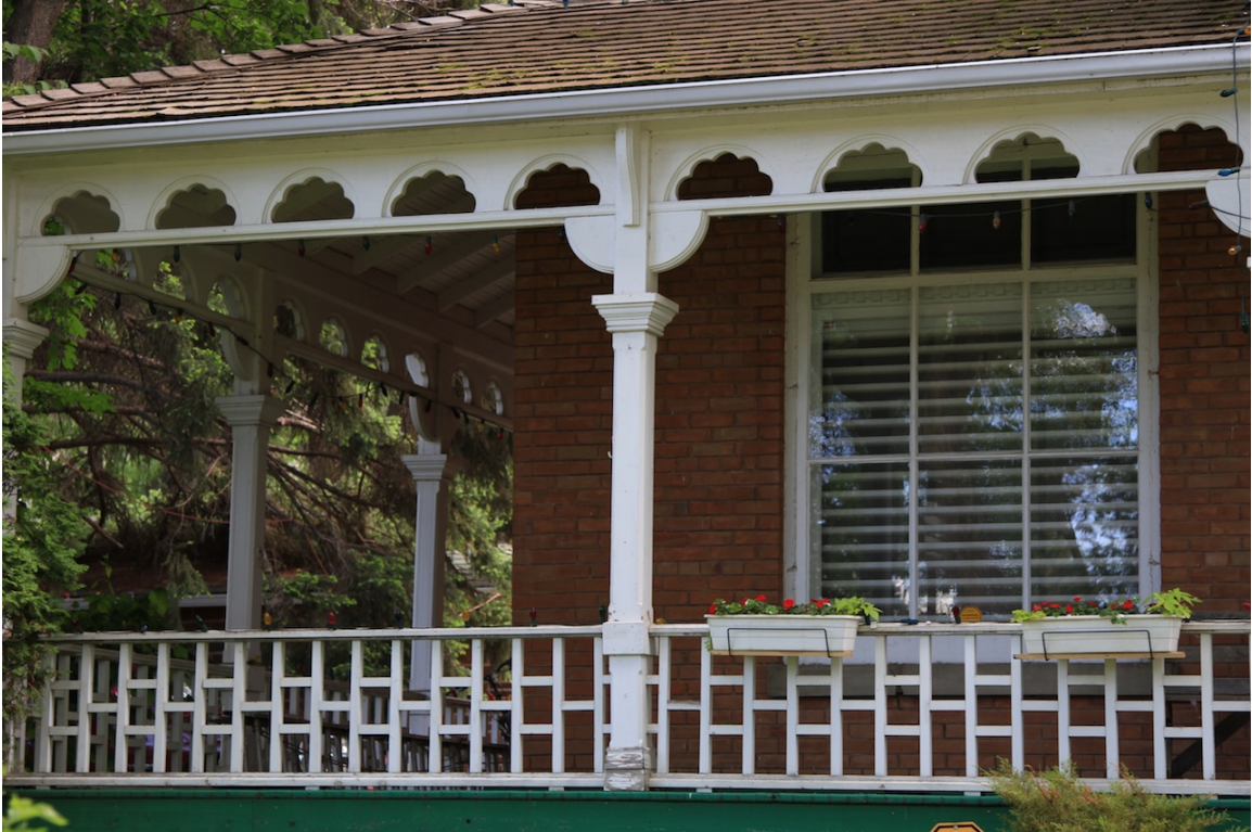
Partial width veranda with detailed frieze (Donald Luxton & Associates, 2014).