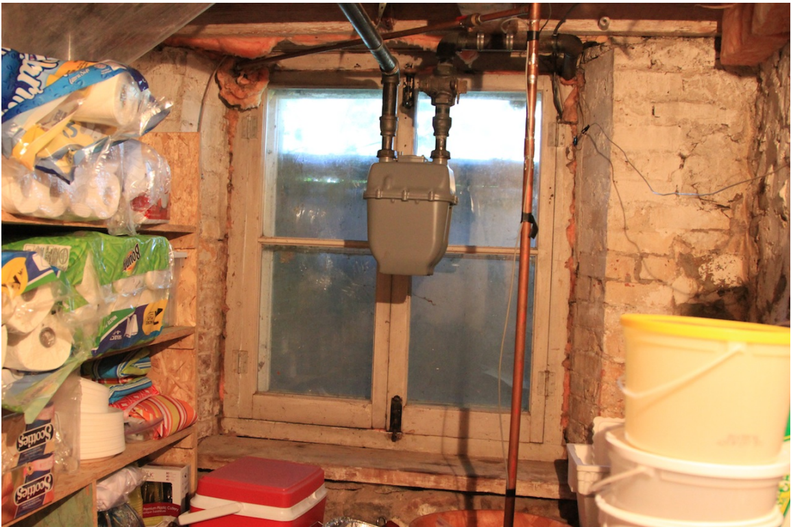
Casement windows with window well in basement (Donald Luxton & Associates, 2014).