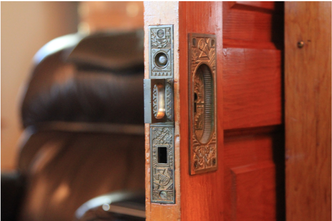
Original door hardware (Donald Luxton & Associates, 2014).