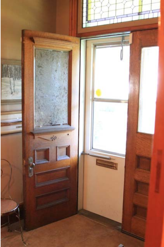
Oak front doors with Eastlake detailing (Donald Luxton & Associates, 2014).