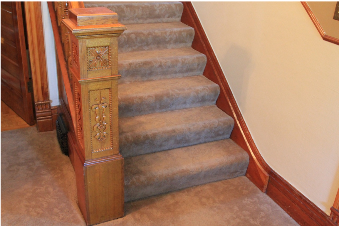
Oak newel post (Donald Luxton & Associates, 2014).