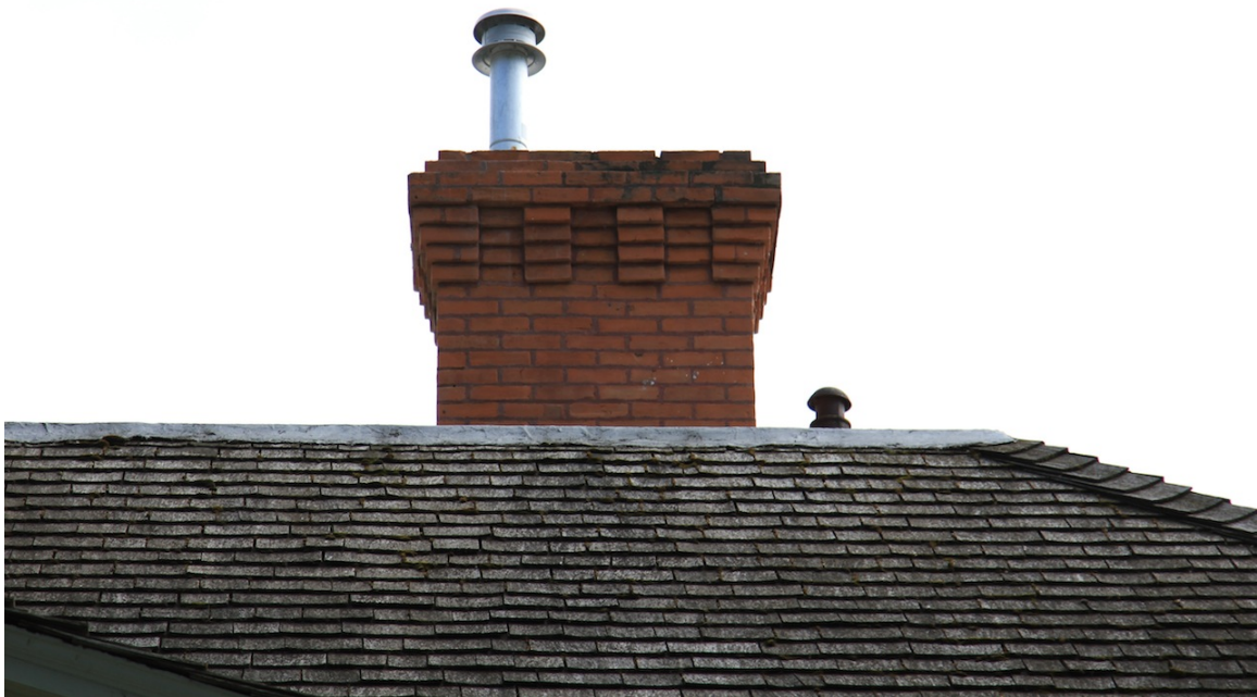
Corbelled chimney.