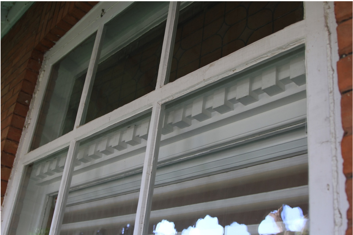
Dentil detailing on windows (Donald Luxton & Associates, 2014).