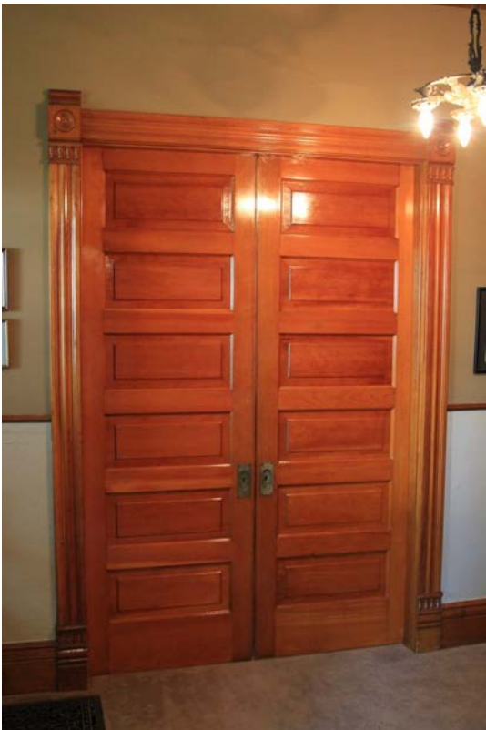
Paneled oak doors to living room (Donald Luxton & Associates, 2014).