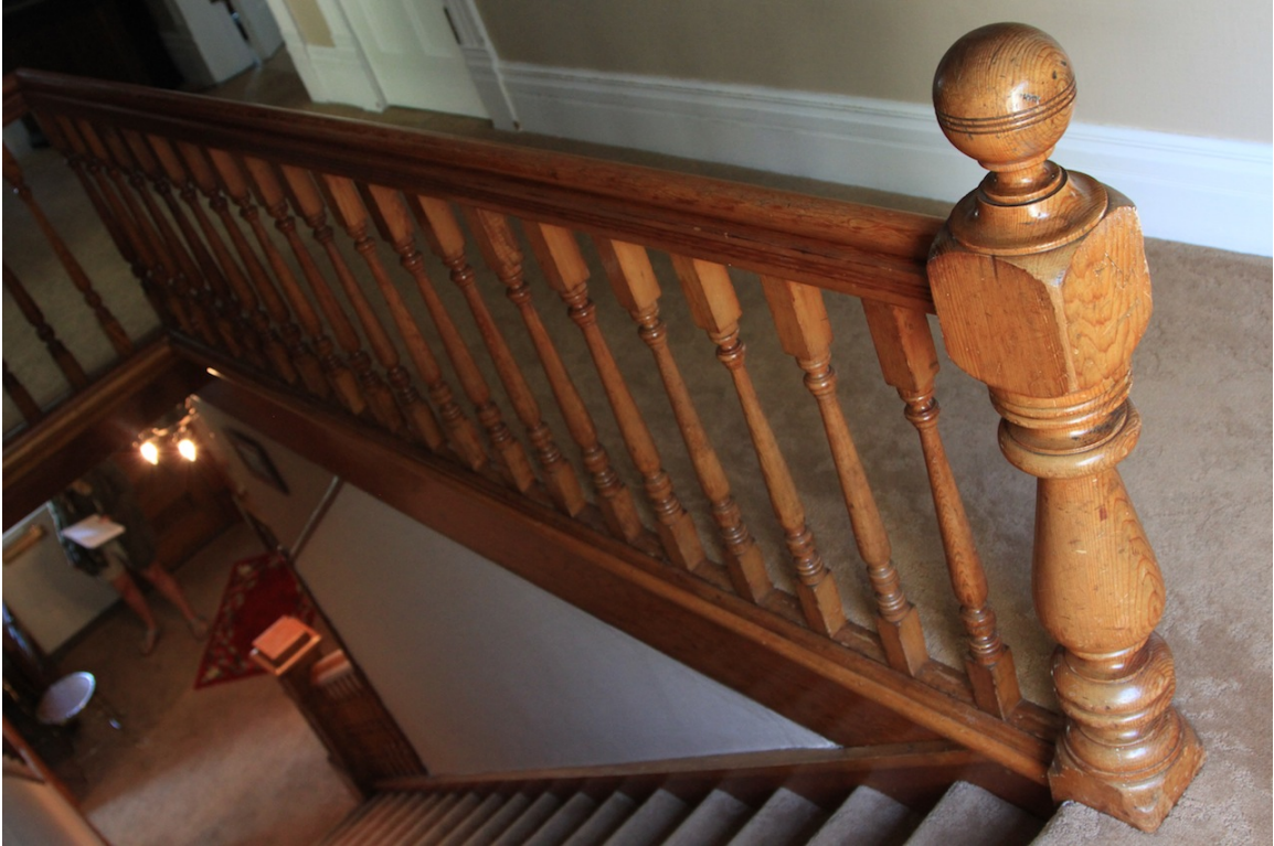
Second storey balustrade (Donald Luxton & Associates, 2014).