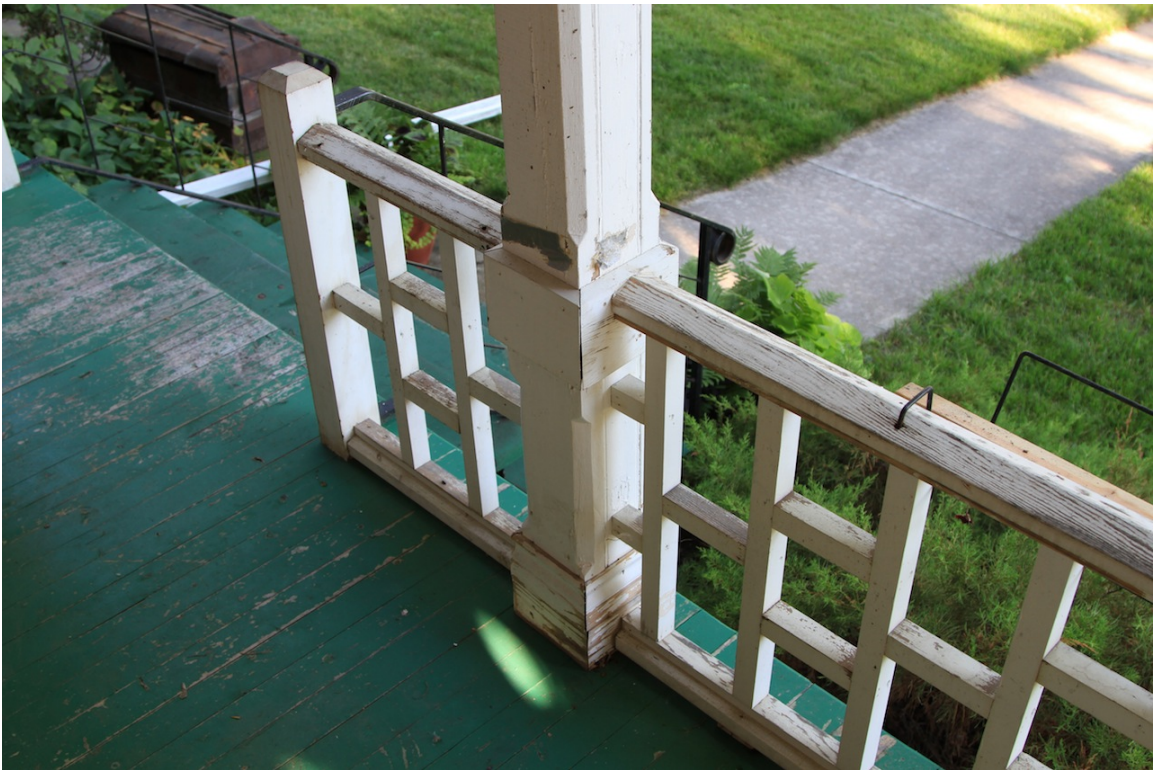
Balustrade and lower part of column replaced (Donald Luxton & Associates, 2014).