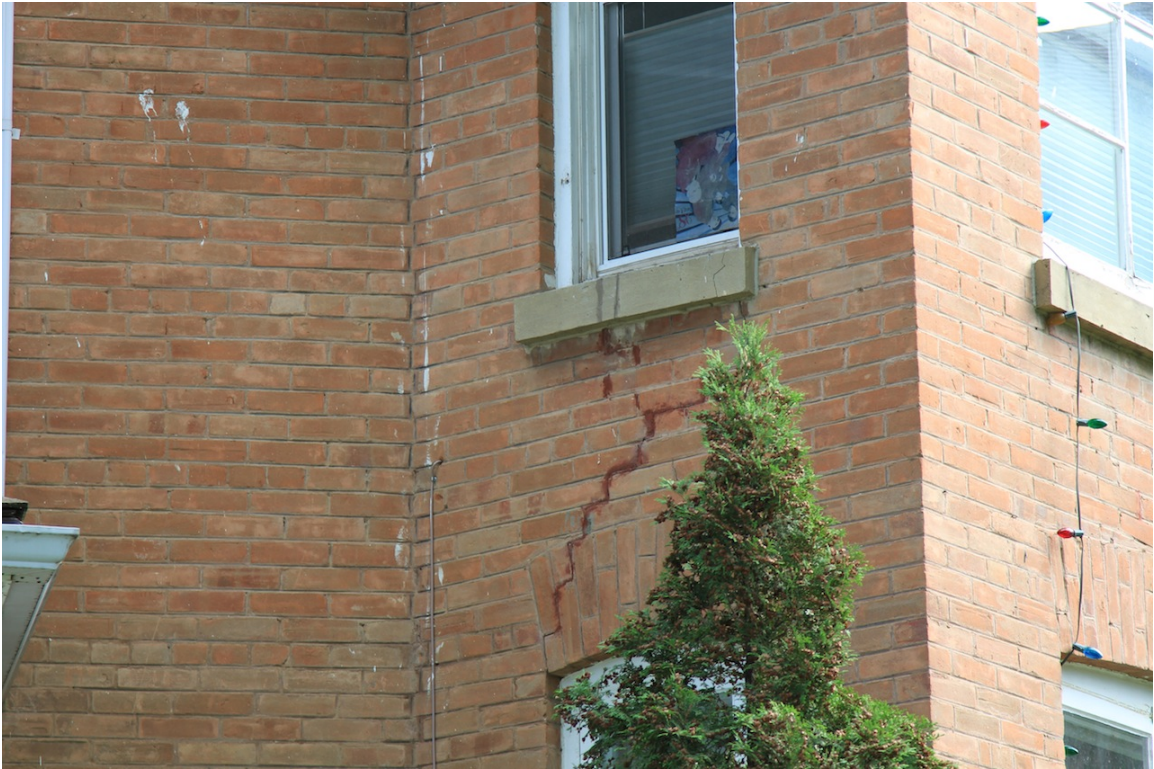
Areas of previous brick repair (on angled front bay) (Donald Luxton & Associates, 2014).