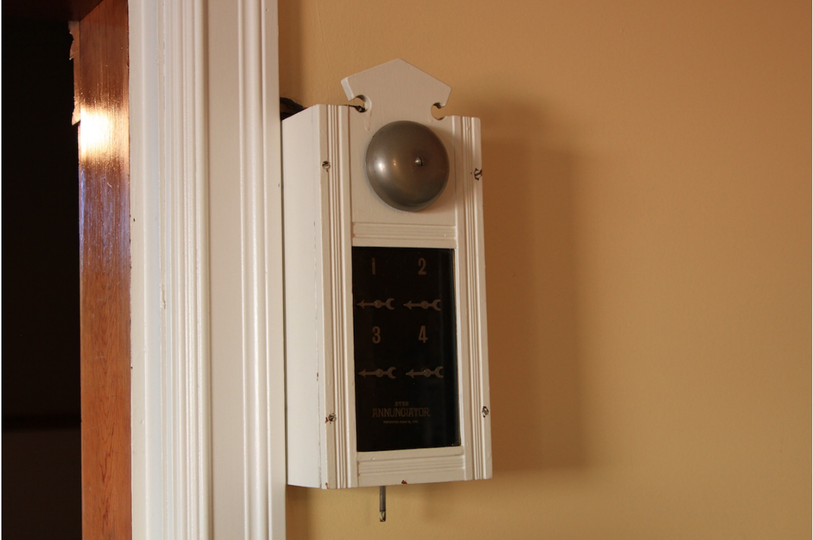
Annunciator for maid in kitchen.