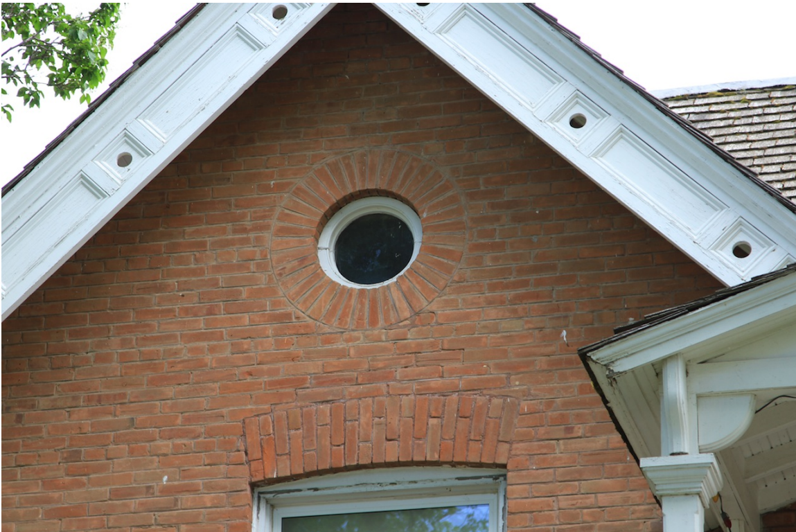
Gable peak showing decorative bargeboard and oeil de boeuf (Donald Luxton & Associates, 2014).