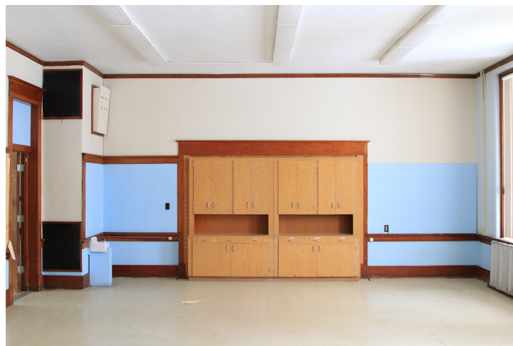
Donald Luxton & Associates February 2013