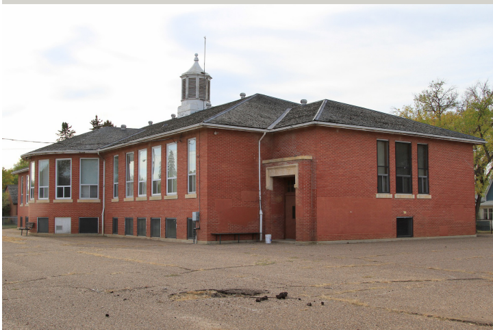
Donald Luxton & Associates September 2012