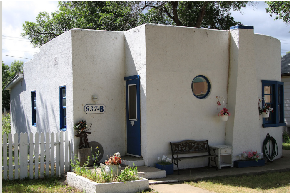
The rear of the Treiber Hodgins Residence showing its flat, stepped parapet roof