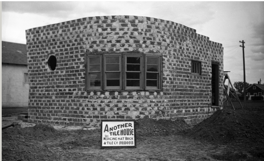
Treiber Hodgins Residence under construction in 1943